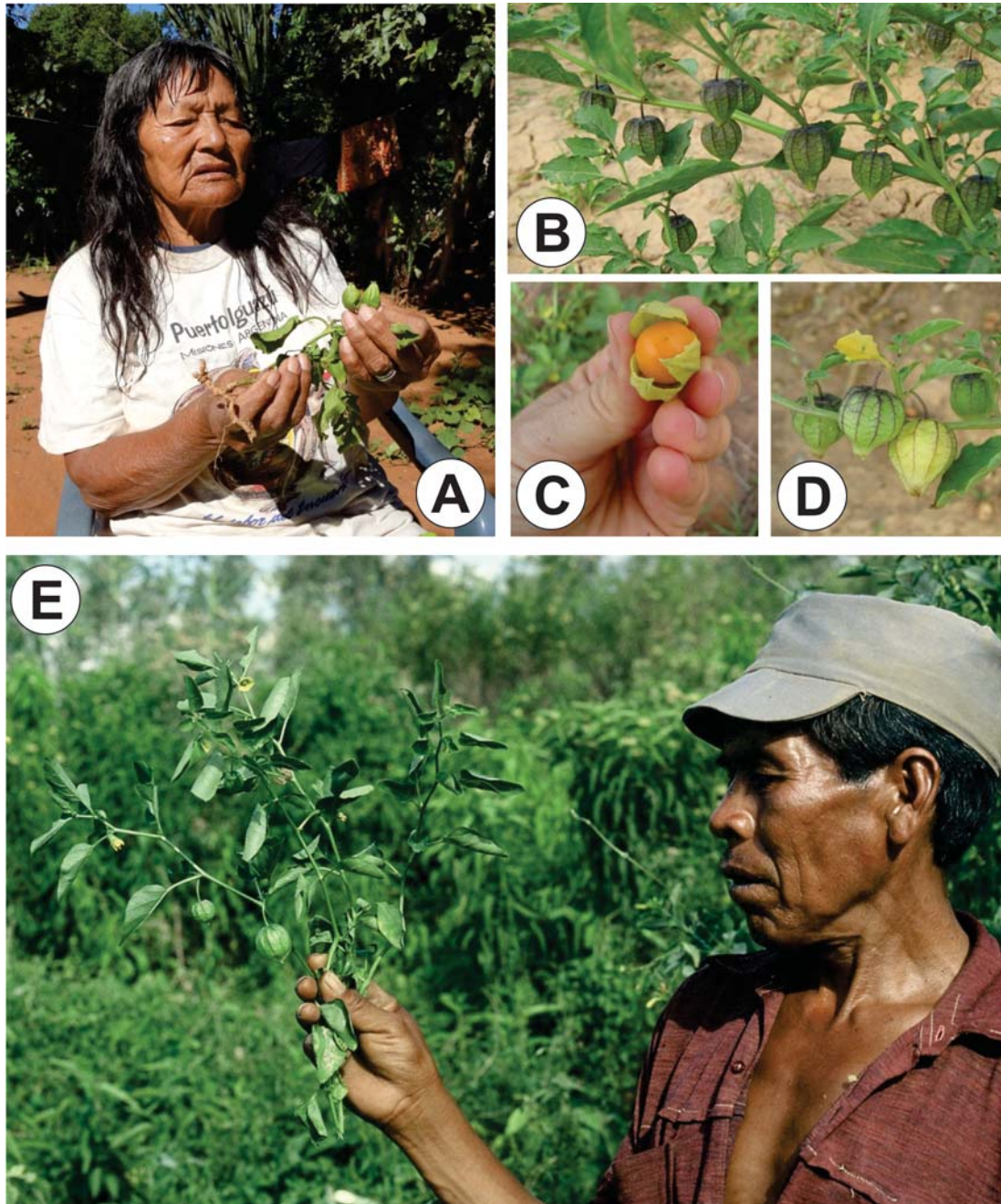
Fig. 2. - Physalis viscosa L. A. A Maká Indian offers information about the plant; C. Ripe fruit with remains of the accrescent calyx; E. A Choroti Indian shows a branch of the plant. Physalis angulata L.; B, D. Branch with fruit.