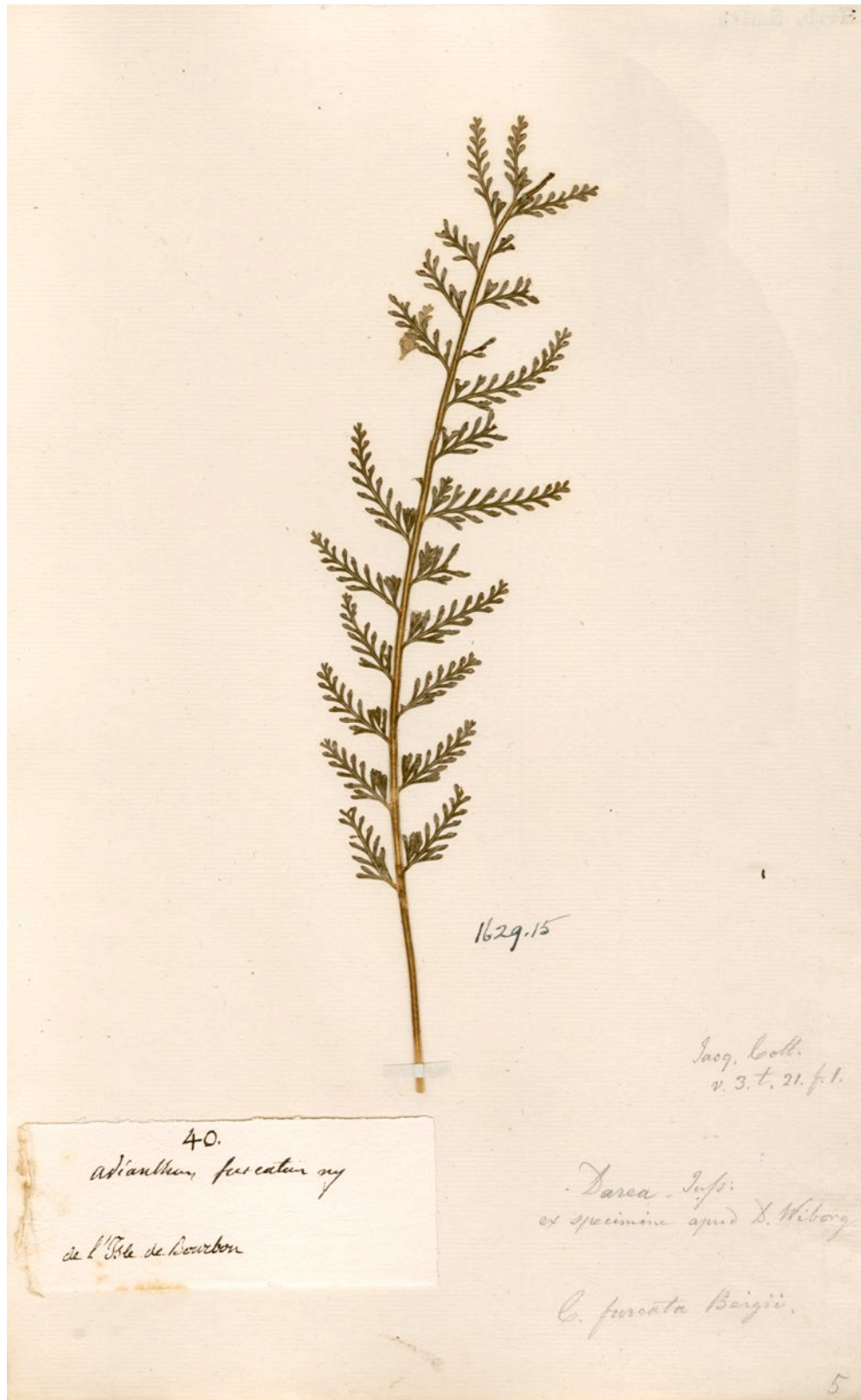
Fig. 6. – Lectotype of Adiantum furcatum L. f. in LINN-HS).