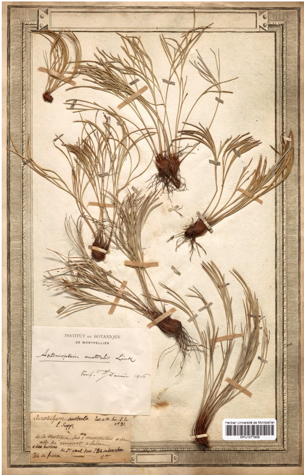
Fig. 3. – Isolectotype of Acrostichum australe L. f. in MPU.