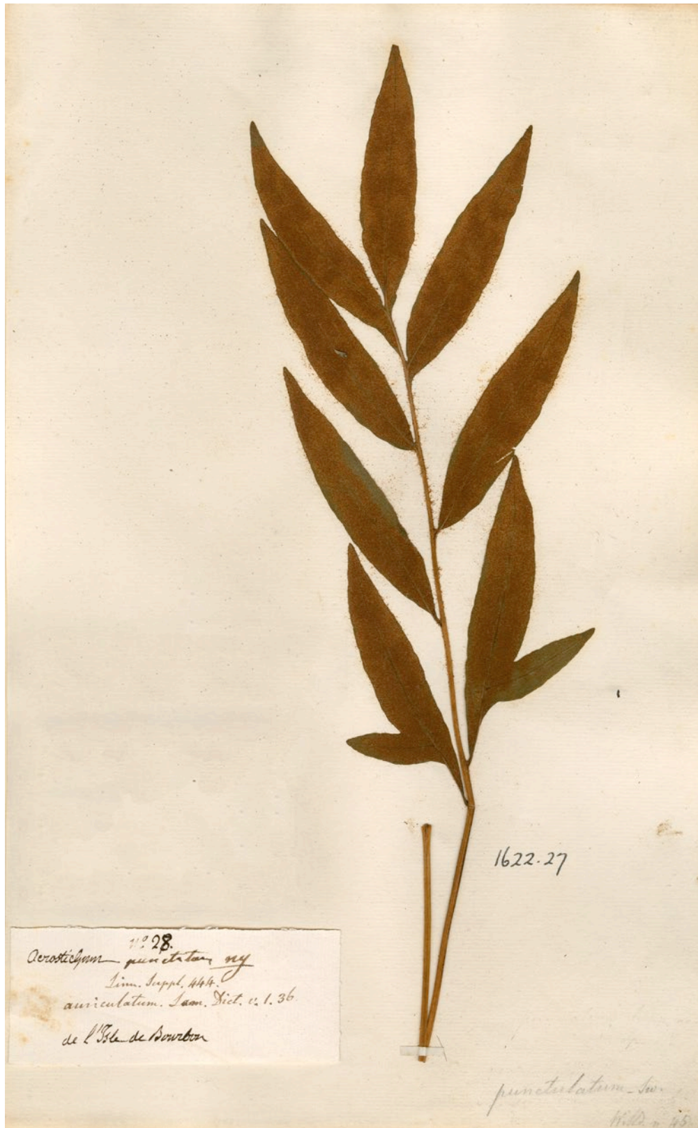
Fig. 4. – Lectotype of Acrostichum punctatum L. f. in LINN-HS.