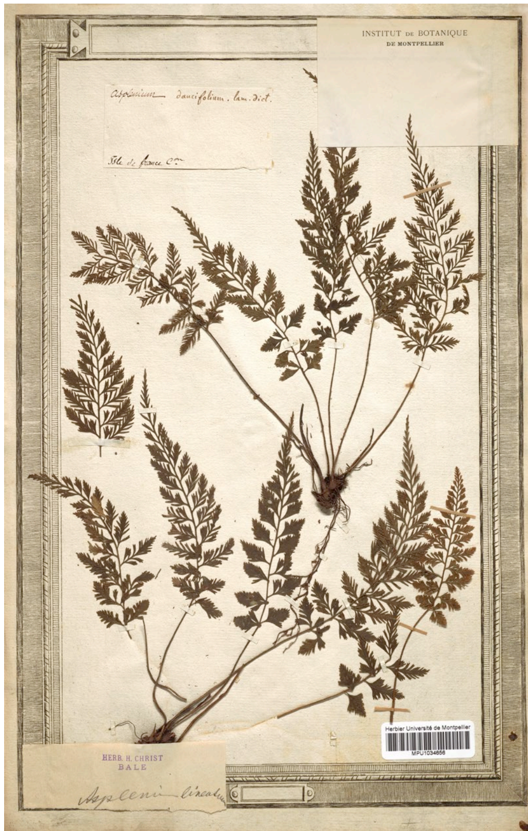
Fig. 5. – Lectotype of Asplenium daucifolium Lam. in MPU.