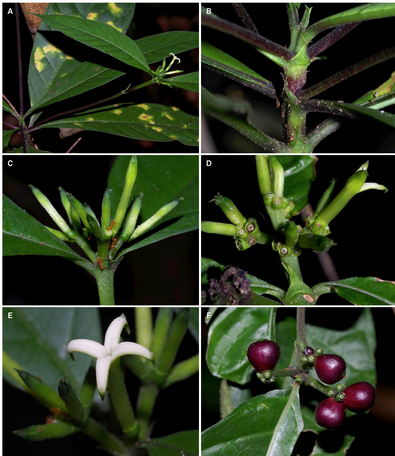
Fig. 3. – Appunia morindoides (A. Rich.) Delprete, C.M. Taylor & T. McDowell. A. Branchlet with inflorescence; B. Stem closeup, showing distalmost nodes with stipules; C. Inflorescence with flower buds, being visited by small ants; D. Inflorescence with most corollas fallen off, showing calyx limbs and disks; E. Open flower (note corolla lobes with apical appendices, both galeate adaxial appendages and abaxial corniform appendages); F. Infructescence with ripe fruits. [ A–C, E: trail to Savane-Roche Corail, Kourou, French Guiana; D: trail Grand Boeuf Mort, Saül, French Guiana; F: Montagne des Singes, French Guiana]