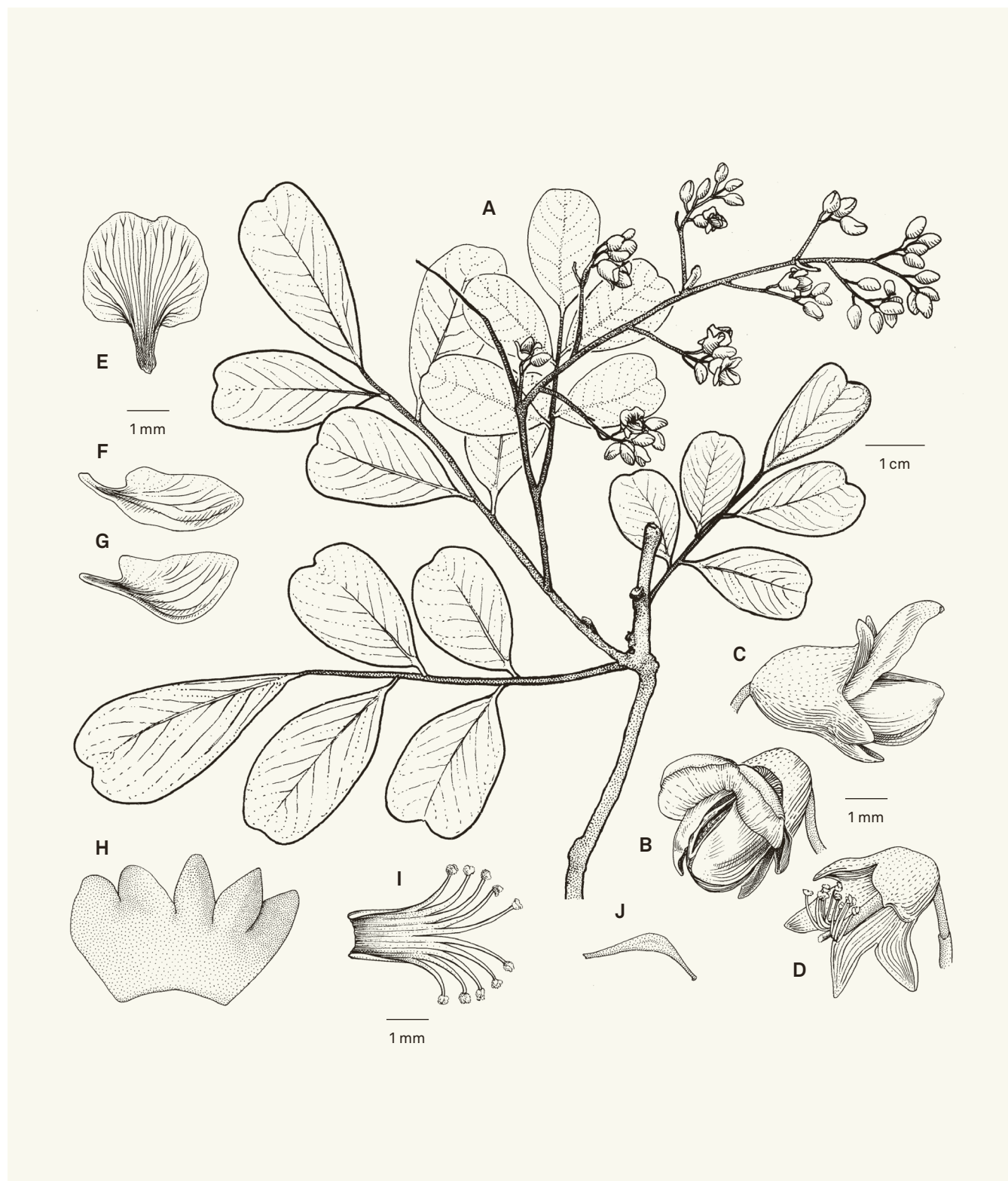
Fig. 5. – Dalbergia obcordata N. Wilding, Phillipson & Crameri. A. Flowering branch; B–C. Flower; D. Flower (with petals removed); E. Standard petal (adaxial surface); F. Wing petal (adaxial surface); G. Keel petal (adaxial surface); H. Calyx (outer surface; split open and flattened); I. Androecium (split open to show adaxial surface); J. Gynoecium. [Gautier et al. 4567, P] [Drawings: M. Lanas]