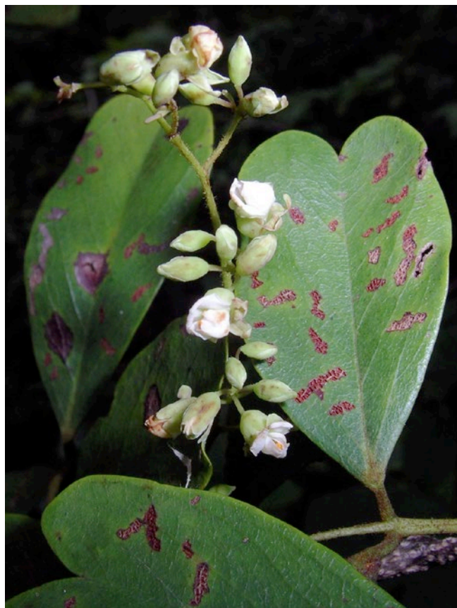
Fig. 6. – Dalbergia obcordata N. Wilding, Phillipson & Crameri. Inflorescence and leaflets. [Gautier et al. 4567]

Notes. – Phylogenomic and population genomic results (CRAMERI, 2020) support the recognition of Dalbergia obcordata as a distinct species and point to only a distant