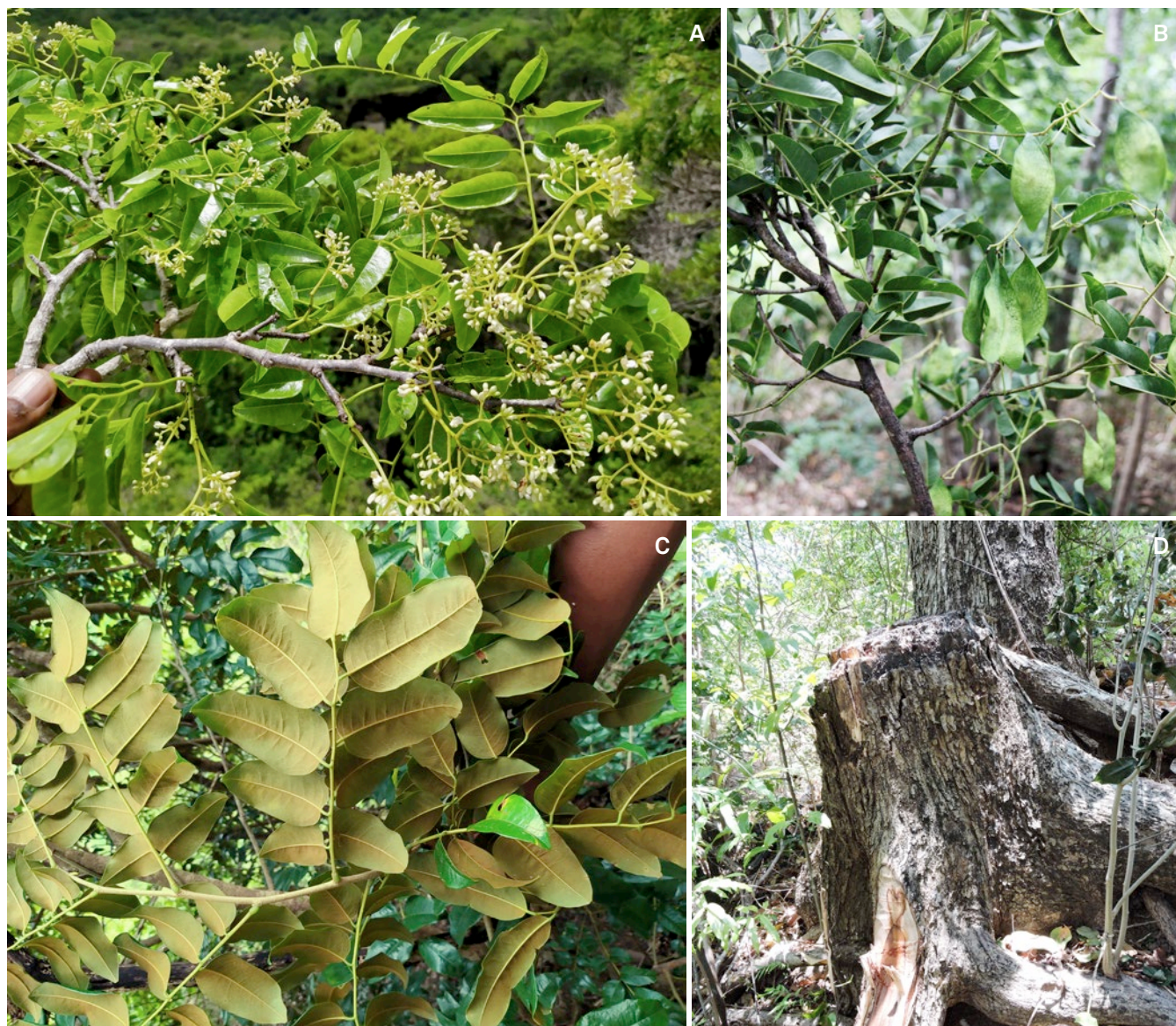
Fig. 2. – Dalbergia antsirananae Phillipson, Cramer & N. Wilding. A. Flowering branch; B. Fruiting branch; C: Leafy branch from coppice shoot, showing underside of leaves with distinctive pale brown indument on the laminae, contrasting with leaves on fertile branches; D: Bole of large felled tree (foreground) and large standing tree (background).

[ A: Randrianaivo 3675; B: Razafitsalama1504; C–D: Randrianaivo 3506]