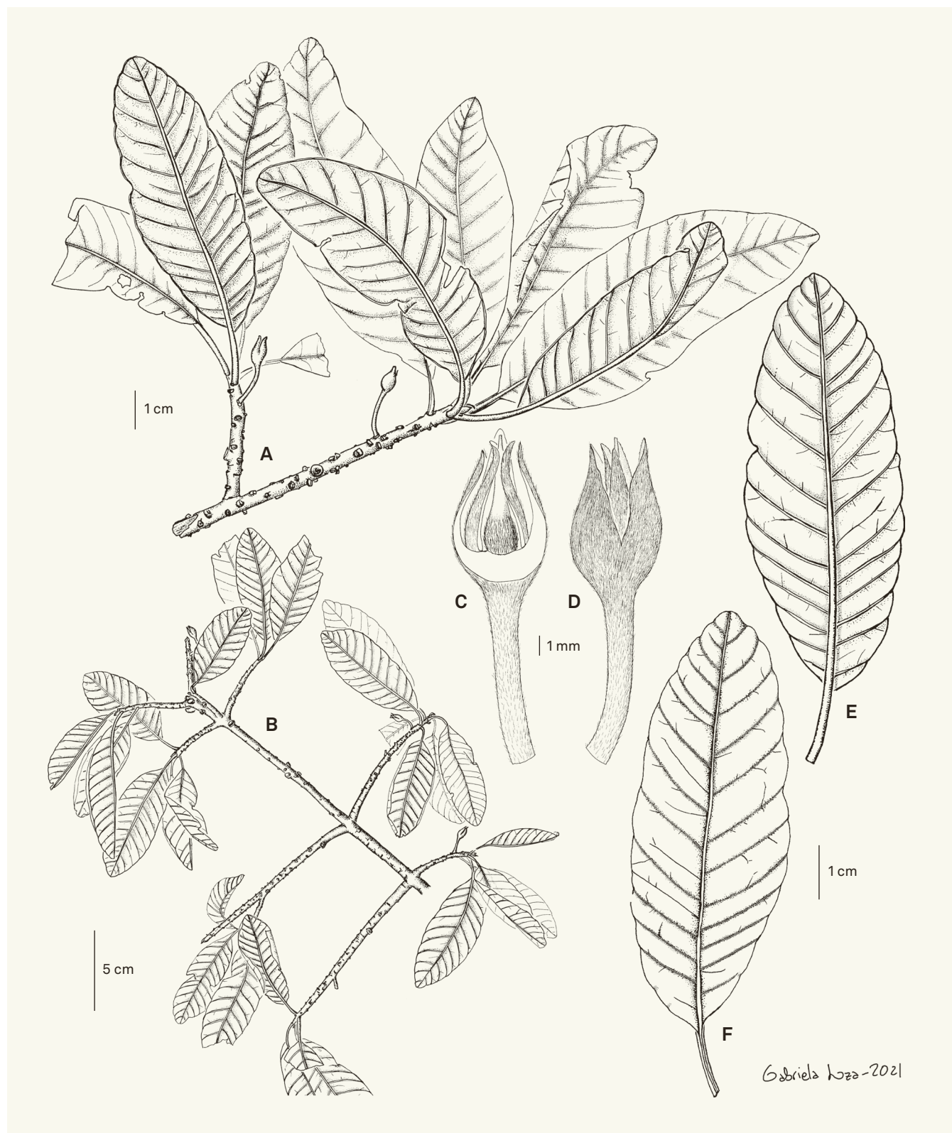
Fig. 3. – Capurodendron namorokense L. Gaut. & Boluda. A. Apex of branch; B. Branch; C. Old flower lacking corolla, dissected laterally; D. Old flower lacking corolla; E. Leaf, abaxial side; F. Leaf, adaxial side. [Gautier et al. 6276] [Drawing: G. Loza]