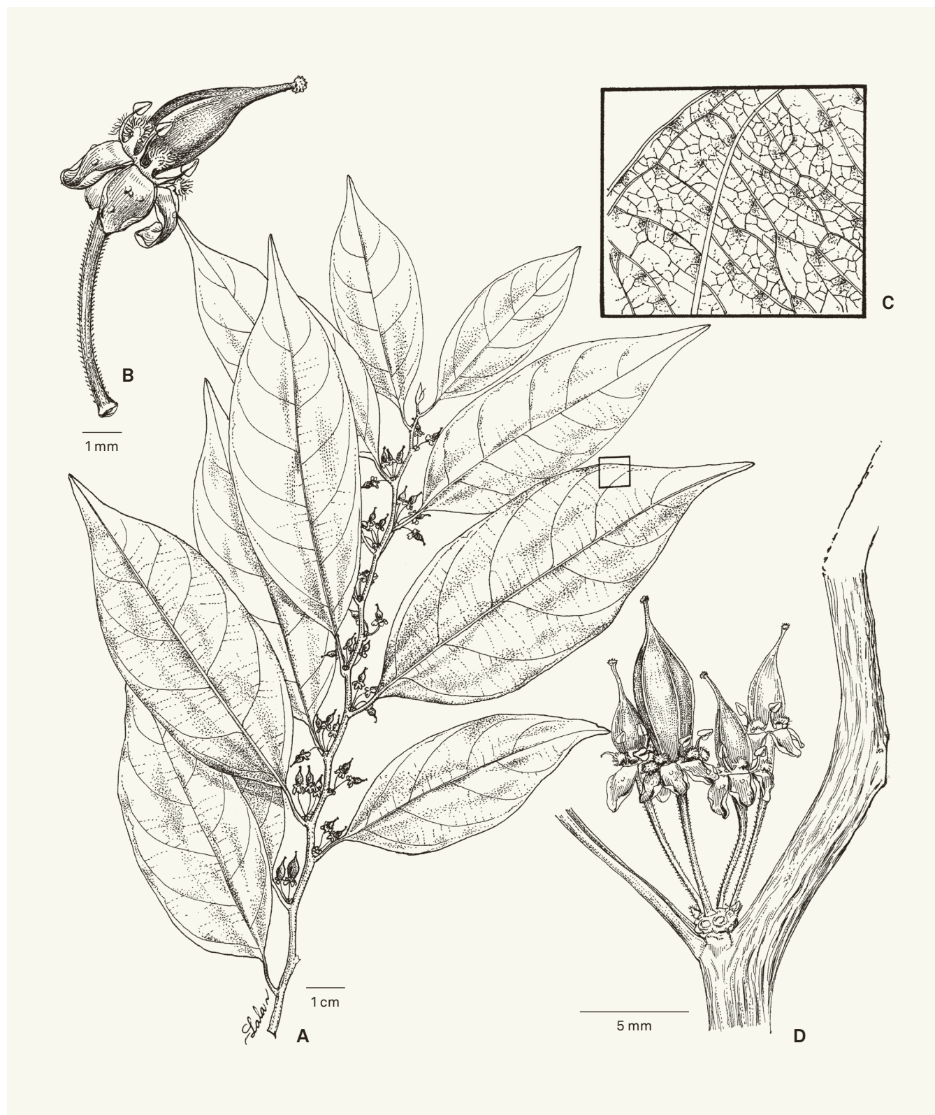
Fig. 1. – Casearia razakamalalae Philpott & Appleq. A. Flowering branch; B. Flower post-anthesis in early fruit development; C. Detail of abaxial leaf surface with conspicuous reticulated higher-order venation; D. Inflorescence. [Razakamalala et al. 5006, TAN] [Drawings: R.L. Andriamiarisoa]