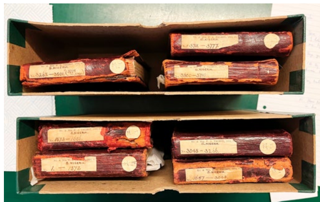
Fig. 7. – Dorothy Amaury Talbot's field notebooks at BM.

flowers, a discrepancy in size that is unlikely to occur within a single compound inflorescence and furthermore, its apical part is ellipsoid, indicating that it is probably from a different collection. Comparison with the sketches in the field notebooks and accompanying information on colour suggests that in the capitulum at around anthesis, the apical ball of fertile flowers should be shorter and more spherical.