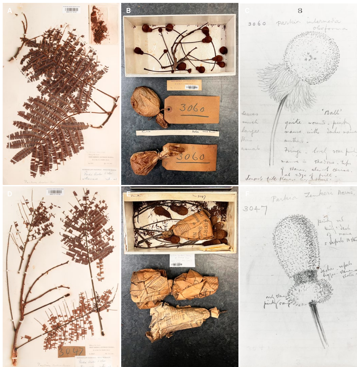
Fig. 6. – Two collections of Parkia bicolor A. Chev. at BM, both from the Eket District, southern Nigeria.

A, D. Herbarium sheets; B, E. Mature capitula wrapped in paper plus others in bud, preserved in the carpological collection; C, F. Corresponding pages from the field notebooks showing a capitulum at around anthesis.