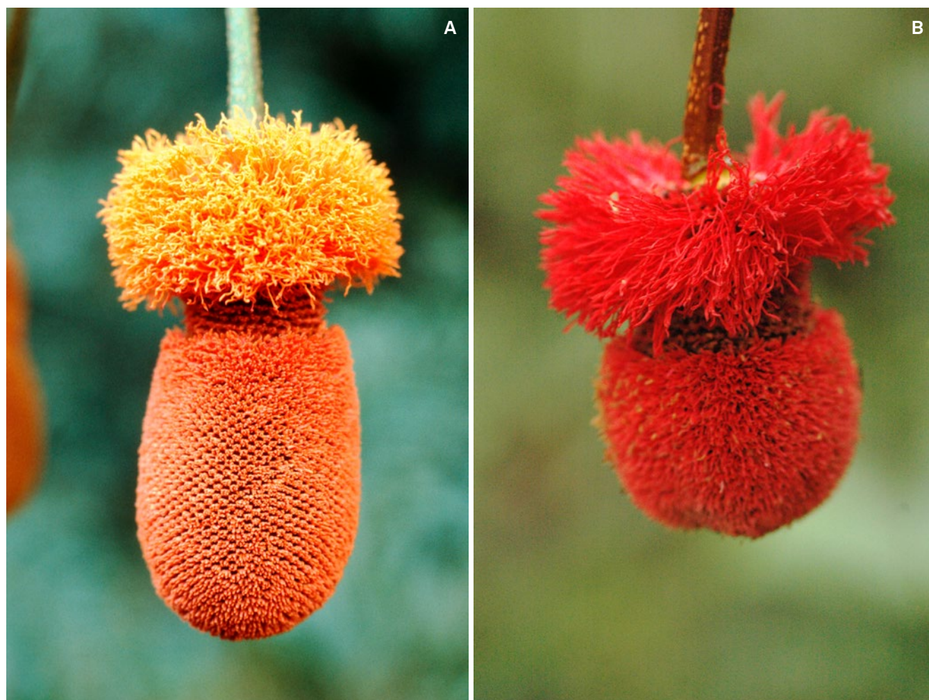
Fig. 2. – Parkia bicolor A. Chev. A. Capitulum approaching anthesis, Korup National Park, Cameroon; B. Capitulum at anthesis, Bouvala, Ngounié Prov., Gabon. Images not to scale.

above, in which the post-anthesis capitula were dark red with a bluish or purplish cast, were also this shape.