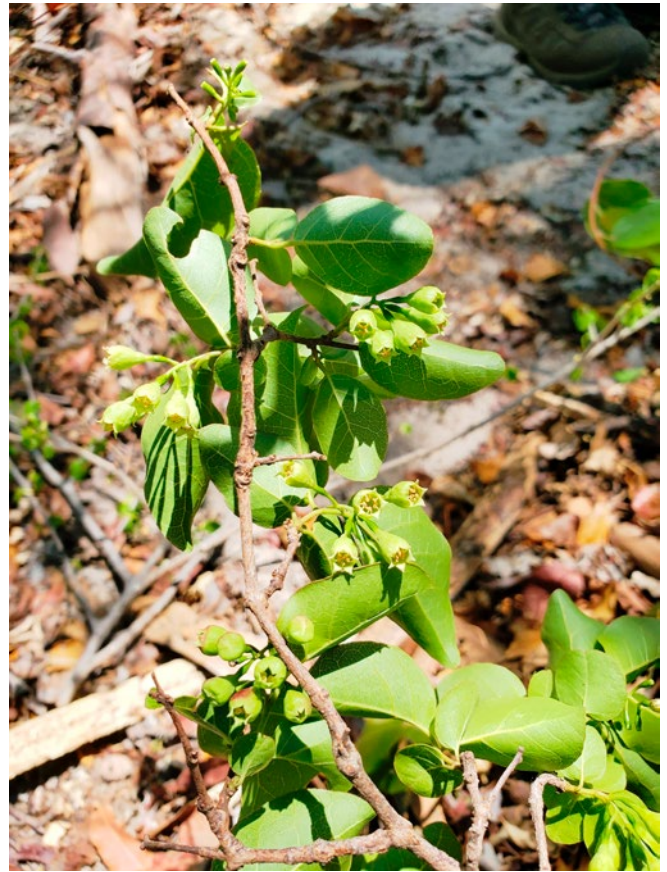
Fig. 4. – Flowering branch of Combretum sphaeroides (Tul.) Jongkind. [Reg. Sofia, Prov. Mahajanga, SW Mampikony, https://www.inaturalist.org/observations/64589856 ]

Conservation status. – Combretum sphaeroides has a very wide distribution from Mahajanga in the North-West to close to Toliara in the South. This species has an estimated EOO above the threshold for the “Vulnerable” status under Criterion B1 of the IUCN Red List Categories and Criteria (IUCN, 2012), i.e., 20,000 km 2 and is known from several protected areas, among them Ankarafantsika, Namoroka, and Bemaraha. We therefore consider C. sphaeroides as “Least Concern” [LC] due to its wide distribution in Madagascar and number of localities.