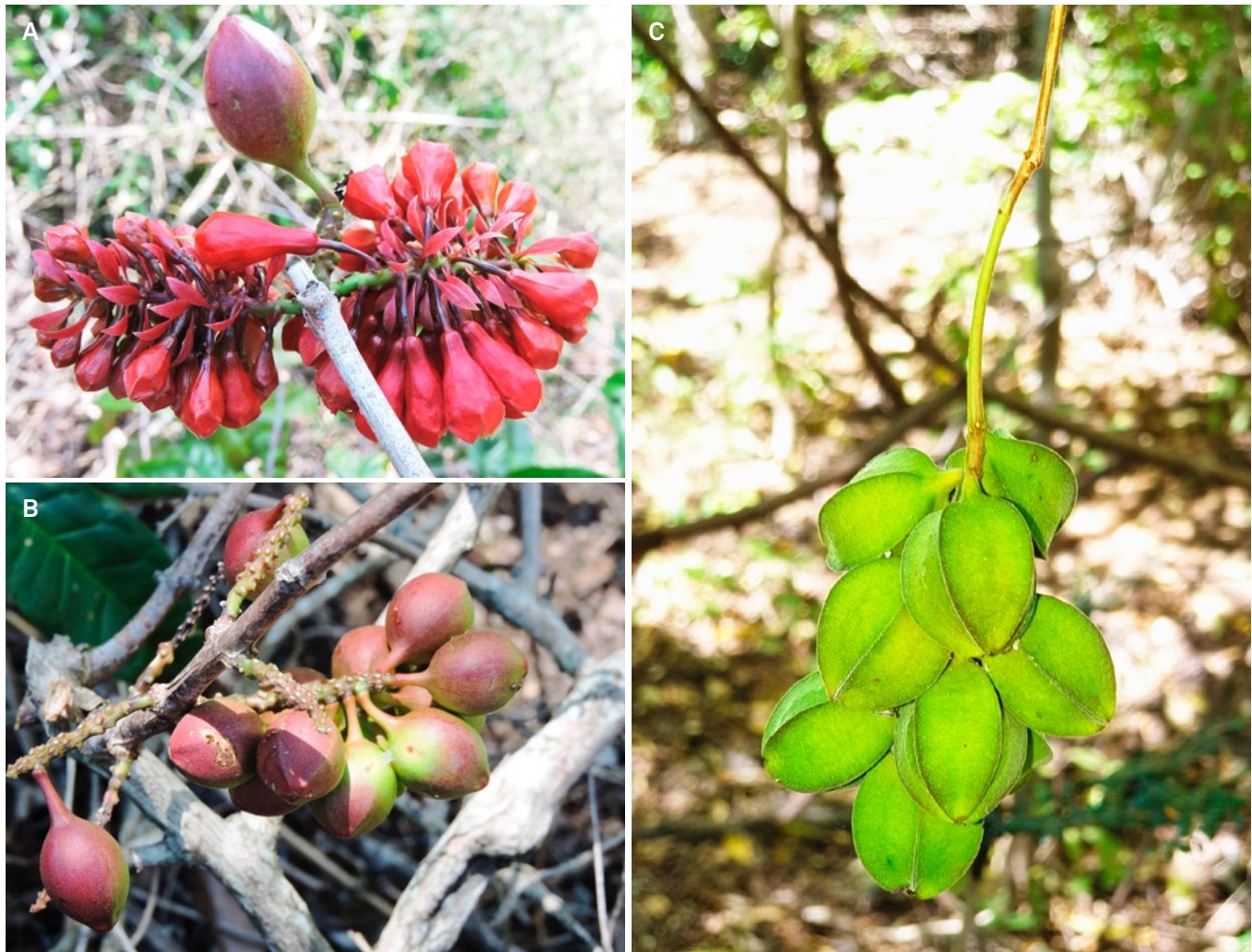
Fig. 1. – Combretum humbertianum (H. Perrier) Jongkind & Callm.: A. Flowers; B. Fruits. Combretum macrocalyx (Tul.) Jongkind: C. Fruits. [A–B: Rakotovoao 7221; C: Reg. DIANA, Prov. Antsiranana, Fkt. Ivovona, https://www.inaturalist.org/observations/28665139 ]

Combretum sakoense Jongkind & Callm. resembles C. calopyxis Jongkind & Callm., but it differs from that species by a shorter (8–9 mm long vs. c. 13 mm long), hairier upper receptacle, and by larger leaves (6–11.5(–14) × 4–6(–12) vs. 1.2–4 × 0.9–2.5 cm).