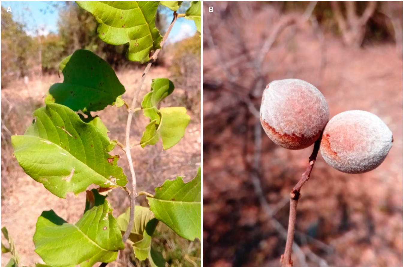
Fig. 3. – Combretum sakoense Jongkind & Callm.: A. Leaves; B. Fruits.

[Rakotoarisoa & Mamy SNGF 4060, K, TAN, TEF; https://www.inaturalist.org/observations/12949066 ]