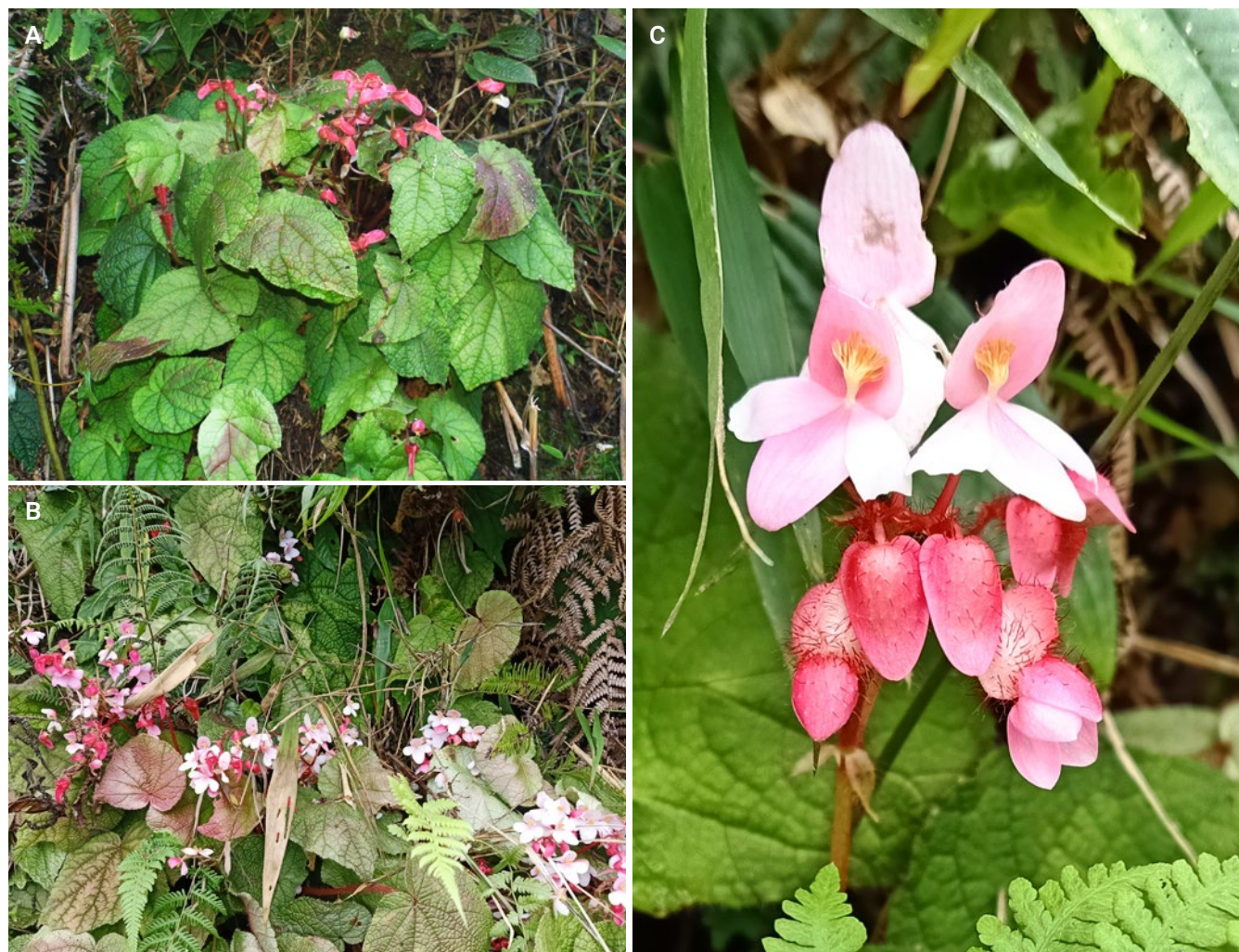
Fig. 2. – Begonia egamii D. Borah, Taram & M. Hughes. A, B. Habitat; C. Detail of staminate flowers showing the unusual asymmetric androecium.

Flowers from November to December, fruiting from December to January.