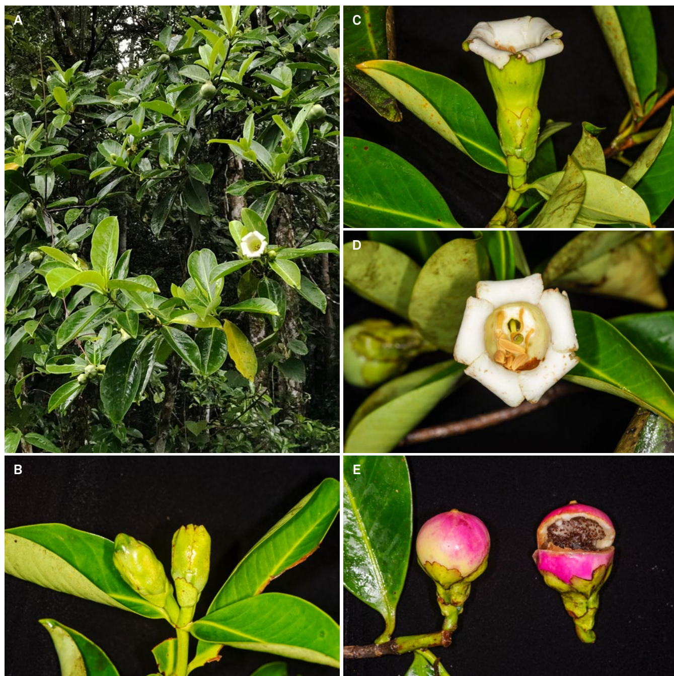
Fig. 3 – Fagraea christinae Y.W. Low & V.A. Albert. A. Habit; B. Close-up of flower buds enclosed by calyx lobes and a pair of bracteoles with distinctive crenate margins; C. Side view of an open flower showing curled corolla lobe margins; D. Top view of an open flower with stamens clearly seen inserted upon a fleshy ring; E. Close-up of pink, mature fruits; fruit on the right artificially cut opened to reveal numerous small and black kidney-shaped seeds.

[A–E: Wanma et al. MAN-SING45]