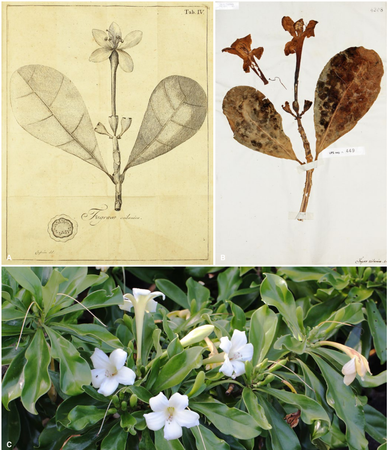
Fig. 1. – Fagraea ceilanica Thunb. A. Reproduction of the illustration, tab. IV (THUNBERG, 1782); B. Lectotype (Thunberg s.n. [UPS-THUNB4308]); C. Flowering plant from Rahathangala, Sri Lanka.