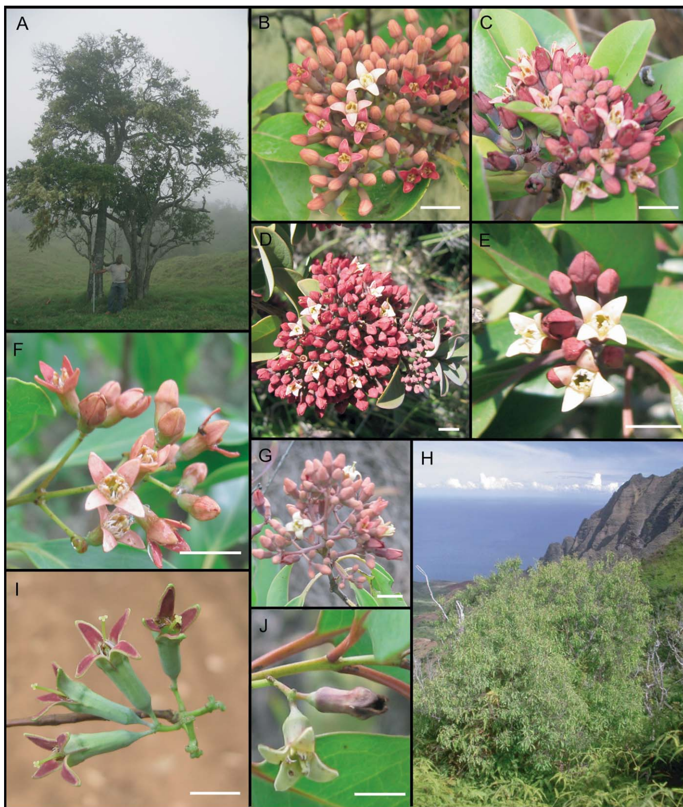
FIG. 3. A-B. Santalum haleakalae var. lanaiense, Auwahi Preserve, E. Maui. C. S. haleakalae var. lanaiense, Kanepu'u Preserve, Lana'i. D. S. haleakalae var. haleakalae, Haleakala National Park, E. Maui. E. S. haleakalae var. lanaiense, Kamakou Preserve, Moloka'i. F. S. freycinetianum Ko'olau Mts., O'ahu. G. S. freycinetianum, Wai'nae Mts., O'ahu. H. S. involutum, above Kalalau Valley, Kaua'i. I. S. pyrularium, Na Pali Kona Forest Reserve, Kaua'i. J. S. pyrularium, Waimea Canyon State Park. White scale bars (photos B-G and I-J) = 7 mm.