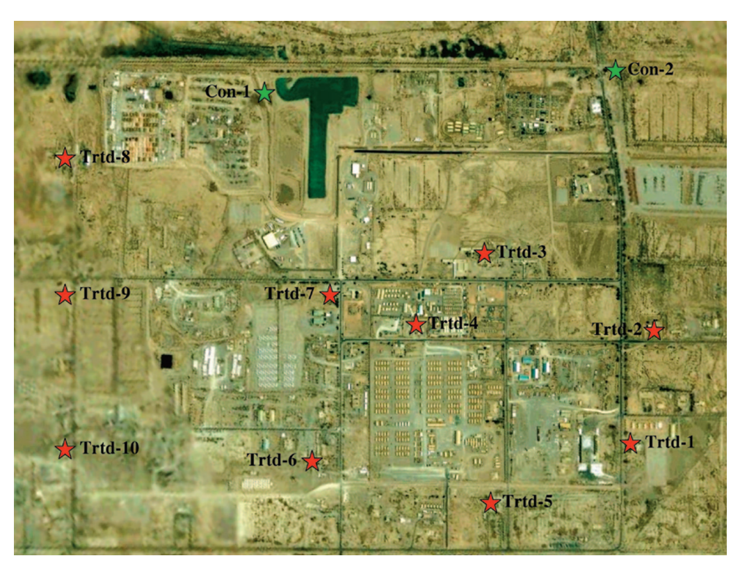
Fig. 6. Schematic map showing the layout of TAB and the locations of the standard traps used in sand fly surveillance.

2004, almost all personnel at TAB lived in air-conditioned tents or buildings.