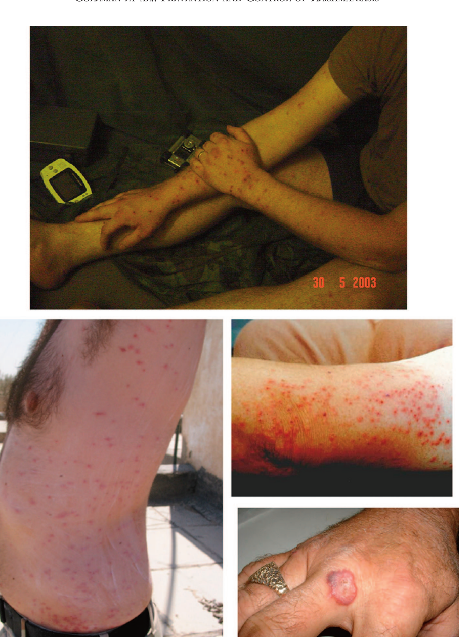
Fig. 5. Typical sand fly bites acquired during a single night on U.S. military personnel stationed at TAB in 2003.

dust occur frequently and adversely affect all activity (human and sand fly). The impact of environmental factors (temperature, wind speed and direction, relative humidity, cloud cover and moon phase) on sand fly activity will be evaluated in a subsequent article.