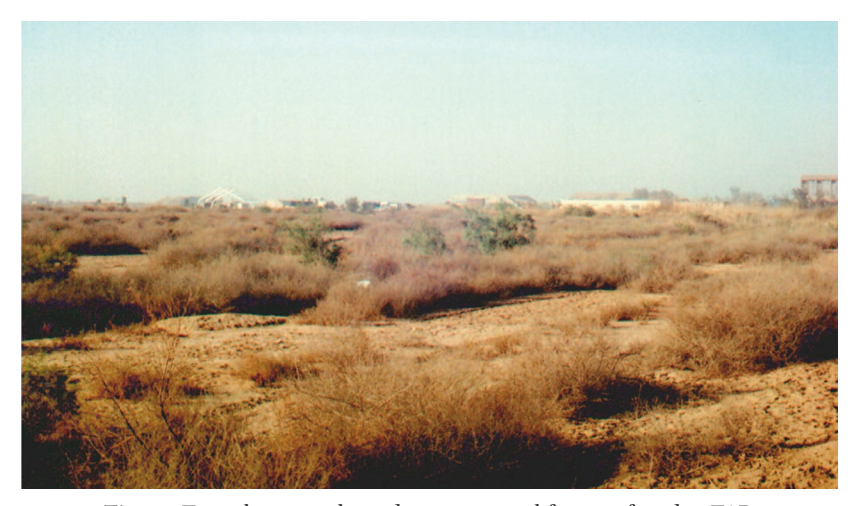
Fig. 2. Typical topography and environmental features found at TAB.

"Everything that does not move is covered in a grayish brown, powdery dust. The heat is oppressive—>120 degrees in the shade, and the open fields and roads bear craters large enough to swallow small trucks. In March 2003, the area around TAB looked more like the surface of the moon than the bustling tent city and flight-line area standing today. After the base fell to coalition