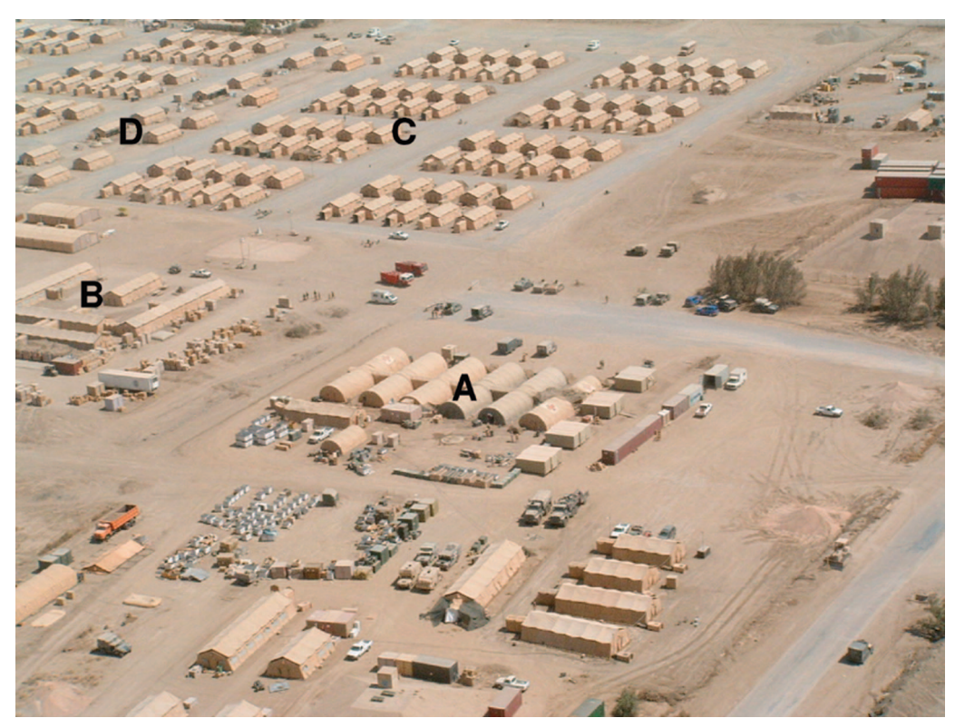
Fig. 3. Aerial view of the U.S. Air Force facility established at TAB in May 2003, including (A) hospital, (B) central dining facility, (C) air-conditioned living quarters, and (D) shower tents and latrine tents.

forces during Operation Iraqi Freedom, the landscape was desolate, save a few abandoned buildings, many of which still had extensive damage remaining from the first Gulf War" (http://www.globalsecurity.org/military/world/iraq/tallil.htm).