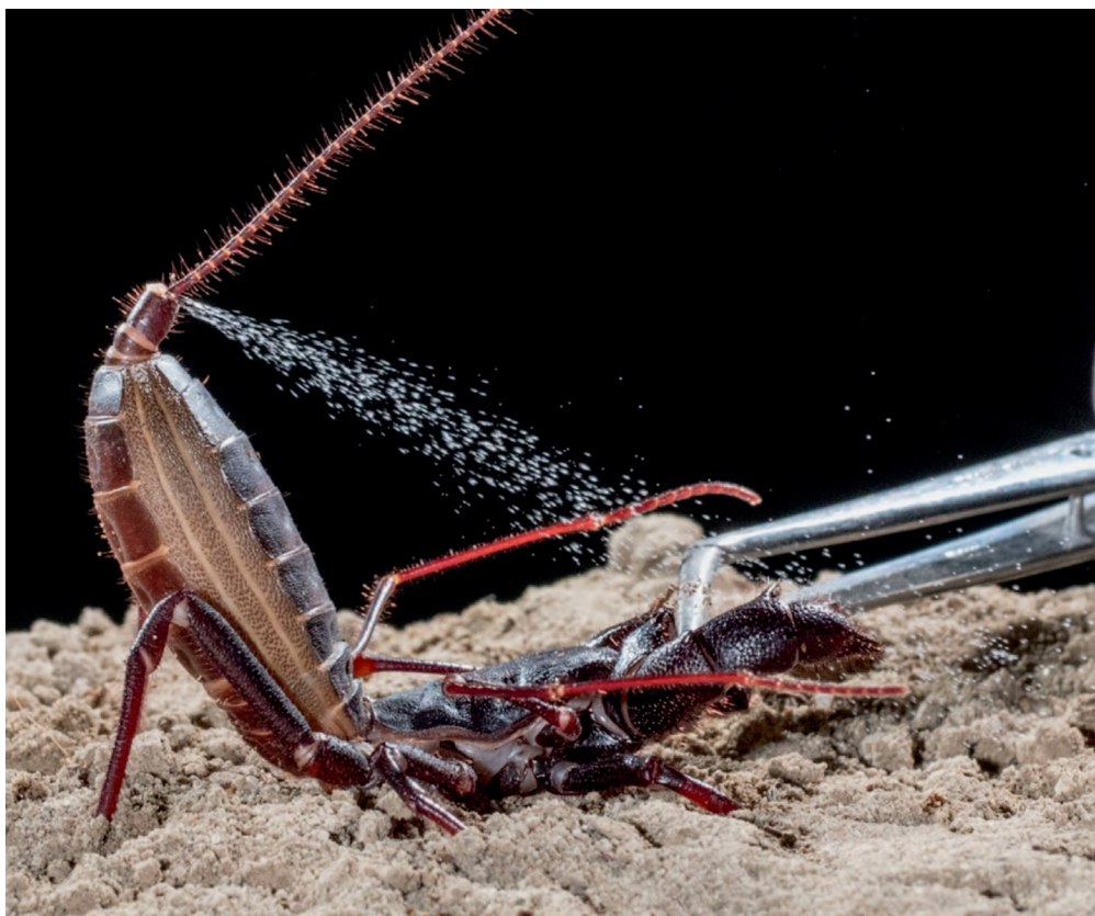
Figure 1.—A vinegaroon spraying its acid containing chemical defense on a threatening attacker (forceps).

vinegaroons (Eisner et al. 1961) and free-living first instar nymphs avoiding the odor of large wolf spiders (Punzo 2005). This paucity of knowledge is partly because vinegaroons are strictly nocturnal creatures that do not fluoresce like scorpions, are not attracted to lights, are dark colored, and are slow moving, making them difficult to study. We report here on field observations and laboratory experiments to determine the breadth of prey that vinegaroons accept, what predators they are likely to encounter, and how various sizes of immatures and adults might behave to minimize risks of predation or cannibalism.