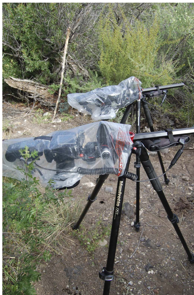
Figure 2.—Camera set-up over nests of Novomessor albisetosus ; field of view includes main nest entrances as well as an extensive area surrounding the nest entrance (approximately 0.152 m 2 covered by each camera).

The similarity in color, size, and eye reflectance of the spider photographed October 12 th and M. chihuahuensis (compare Fig. 3 with Fig. 4) is compelling. The adjacency of the photographed spider with ants, particularly dead ants, also strongly suggests this to be M. chihuahuensis . The fact that the spider never left the vicinity of the nest entrance; was not photographed away from the entrance, despite five nights of filming and nearly 4000 images surveyed; was