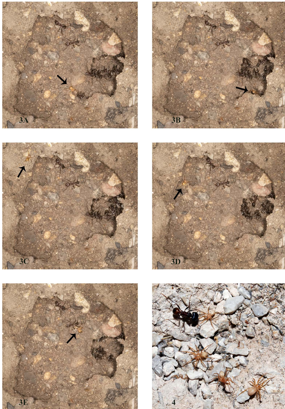
Figures 3–4.—Images of Myrmecicultor chihuahuensis in the direct vicinity of the nest entrance of a Novomessor albigetosus nest on October 12, 2022. (A) Spider approaching a dead ant; (B) Spider entering the nest entrance; (C) Spider at the lip of the entrance; (D) Spider inside the depression of the nest entrance; (E) Spider next to another dead ant in the depression of the nest entrance. Arrows point to the location of the spider; (4) Nest of Pogonomyrmex rugosus in the Chihuahuan Desert in Mexico with Myrmecicultor chihuahuensis on the surface with the ants.

seen entering the nest; had been collected previously from the nest excavation pits; and has a CHC profile similar to species of Novomessor suggests that this spider is a myrmecophile as well as a myrmecophage, spending some or all of its life cycle inside the nest chambers of the ant nest. The observations by David Lightfoot of