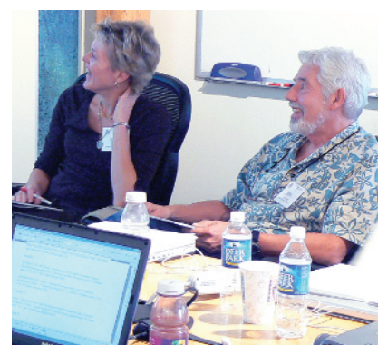
Fall colors are evident outside the window as the working group, “Towards an Integrated Database for Fish Evolution,” meets inside one of NESCent’s conference rooms (top).