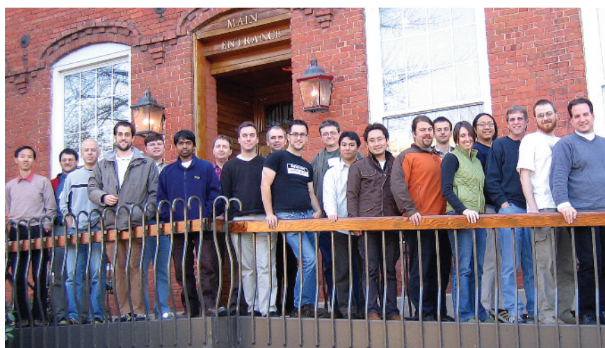
The programmers and biologists who attended a five-day “phyloinformatics hackathon” stand outside the old Erwin Cotton Mills building, now home to NESCent.

Just over two years ago, the National Science Foundation (NSF) established NESCent, granting $15 million over five years to foster and encourage what it termed “a grand synthesis of the biological disciplines through the unifying principle of descent with modification.” The intent: Do for evolutionary biology what