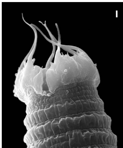
The most abundant nematode in Taylor Valley, Scottinema lindsayae , is viewed with a scanning electron microscope. Scale bar is 1 micrometer.