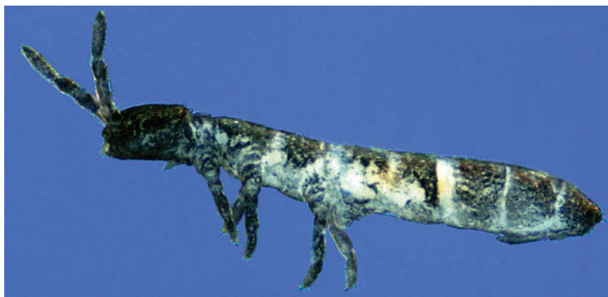
This springtail species, Neocryptopygus nivicolus (actual size 0.9 mm), is found only in the vicinity of Mount Seuss.

Hogg studies springtails and mites, not nematodes, but despite the species' different life history strategies, all of those invertebrates manage to survive in Antarctica. And at one point, the concentration of them at this particular locale seems to have been more diverse than expected. Adams and Hogg, studying the different animals, hope to test a hypothesis that this area once provided a safe refuge for the different species when living conditions in surrounding areas turned hostile. "In most of the Dry Valleys, there is only one species [of springtails]," Hogg says. "However, at Mount Seuss there are three, which is why we think it may be a refuge."