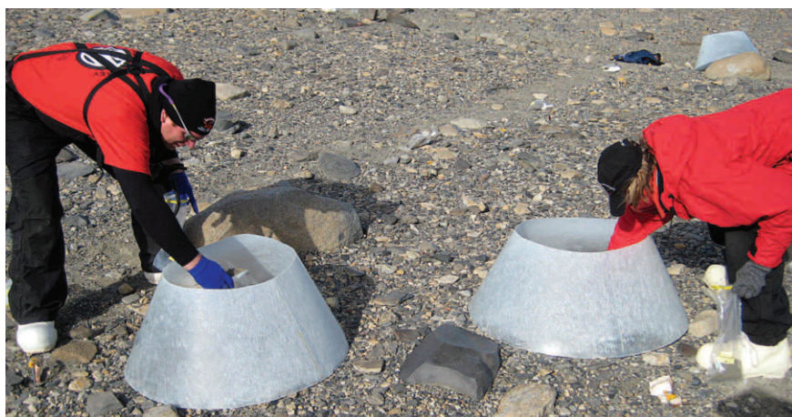
At Lake Fryxell, Byron Adams and Diana Wall sample their stoichiometry experiment.