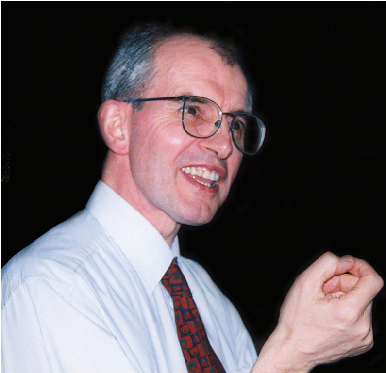
RAYMOND JOSEPH O'CONNOR, 1944–2005

data in the others, so that the value of the whole exceeded the sum of the parts. This paper, those on other species, and Raymond's participation in the 1983 "Birds and Man" Symposium in Johannesburg, were influential in establishing the national Bird Populations Data Bank and Avian Demography Unit as a South African version of the BTO.