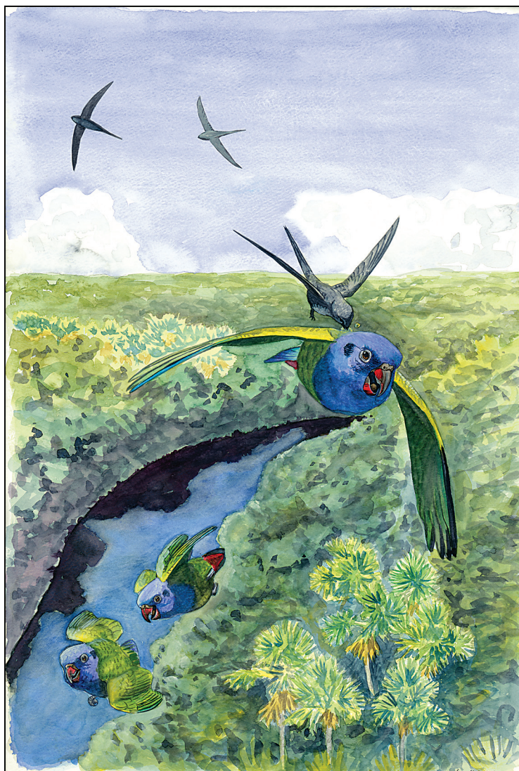
FIG. 1. A Fork-tailed Palm-Swift attacks Blue-headed Parrots ( Pionus menstruus ). Painting by Daniel F. Lane.

however, of being practically inaccessible to vertebrate predators, including primates and snakes. Construction of nests inside these dead palm leaves may have required the use of ultra-lightweight, flexible material with high insulative properties that could be structured with saliva. Feathers from other birds, especially those of pigeons and parrots, emerged as the evolutionarily ideal resource for these fast-flying, agile swifts. Indeed, many apodine swifts, in their very narrow wings and long, forked tails appear to be built for aerial piracy, which is remarkably convergent with frigatebirds ( Fregata spp.; Thomas and Balmford 1995), which obtain a fair amount of their food by chasing and out-maneuvering other birds.