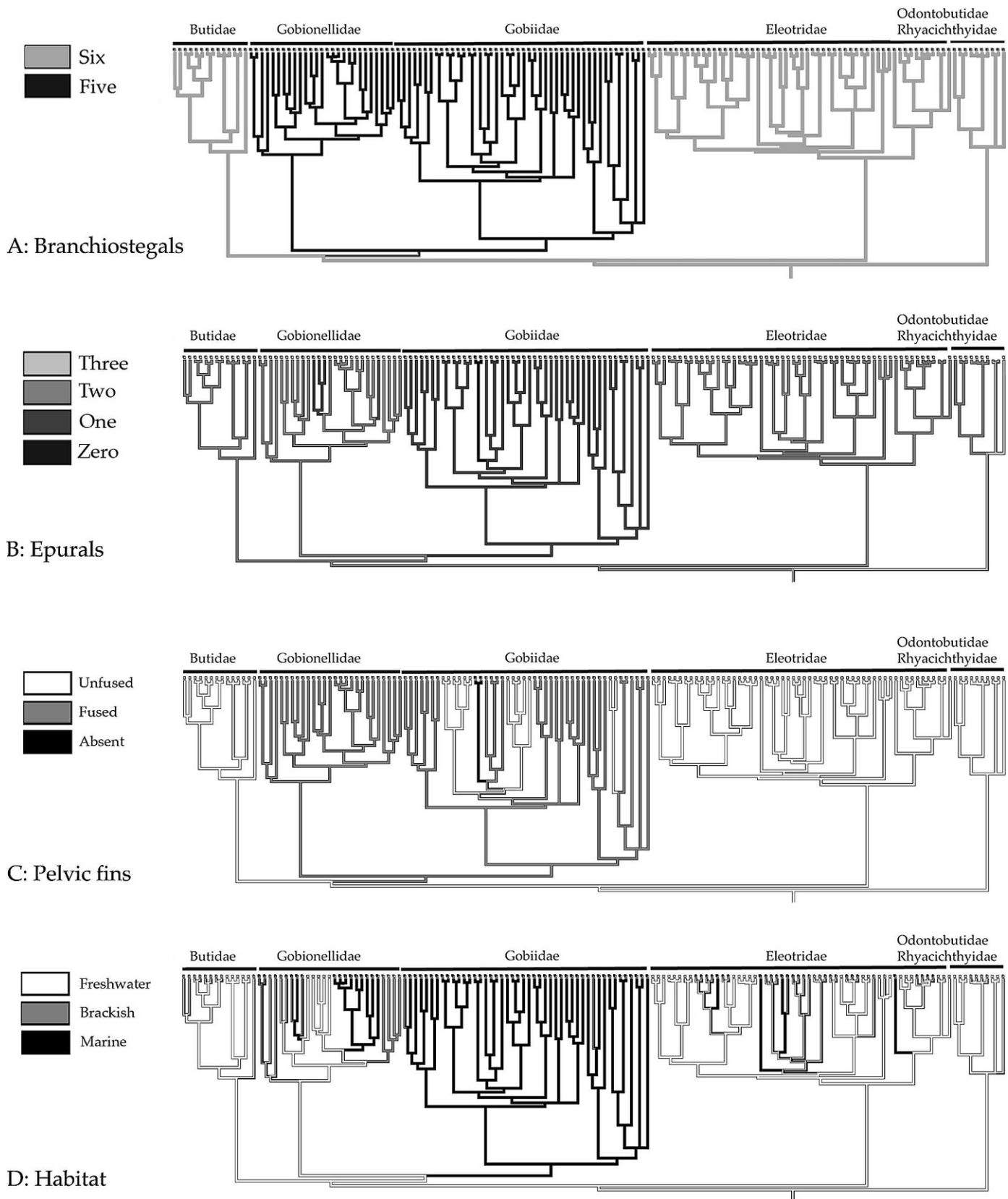
Fig. 2. Characters optimized on the phylogenetic hypothesis. (A) Number of branchiostegals; (B) number of epurals; (C) presence or absence of fused pelvic fins; (D) habitat. Outgroups are not shown, but were included in the character optimization; the state shown at the root of each phylogeny is that optimized for Gobioidae in comparison to outgroups.