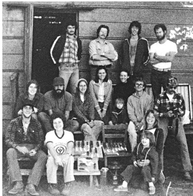
FIG. 2. —My 1st mammalogy class at Louisiana State University in 1979. At least 3 students in this class became professional field biologists, and there may have been others.

The increasing number and complexity of regulations. —Bureaucratic regulations, including foreign, federal, state, and local research permits; permits for collection, importation,