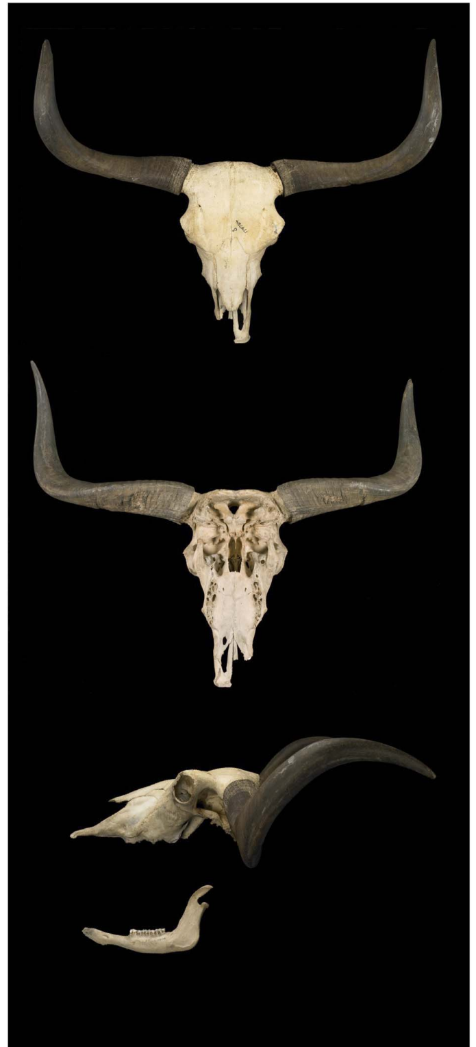
Fig. 4. —Dorsal, ventral, and lateral views of skull and lateral view of mandible of an adult male domestic yak ( Bos grunniens ); zoo specimen of unknown origin (National Museum of Natural History, specimen 174734). Greatest length of skull 525 mm.

The alimentary organs of the yak have evolved to deal with the limited forage availability and quality in its native range (Wiener et al. 2003). The mouth is broad, muzzle small, and lips flexible. Incisors have flat grinding surfaces,