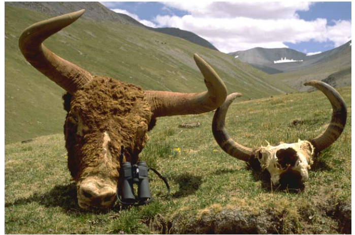
Fig. 3. —Skulls of male (left) and female (right) wild yaks ( Bos mutus ) from Yoniugou, central Qinghai, China, highlighting relative mass and sexual dimorphism in skull size and horn shape.

Relative to mass, a small female wild yak may be only one-third the size of a large male; in contrast, female domestic yaks are 25–50% smaller (Harris 2008; Miller et al. 1994; Wiener et al. 2003). Body mass (kg) of adult male wild yaks has been estimated at >800 kg (Engelmann 1938) and as high as 1,000 kg (Schäfer 1937; Wiener et al. 2003:43) and 1,200 kg (Lu 2000; Lu and Li 1994); females are about