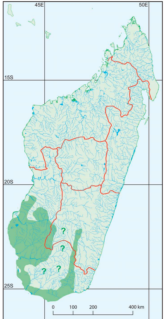
Fig. 3.—Distribution of Lemur catta .

The peculiar vulpine aspect of the head of L. catta is not so much due to an elongation of the muzzle as to the retention of a moist, glandular rhinarium and the upper jaw supporting it projecting beyond the level of the chin. The naked rhinarium continues down in front as a strip of grooved, naked skin that cleaves the upper lip. The upper lip adheres to the premaxillae, making it incapable of protrud-