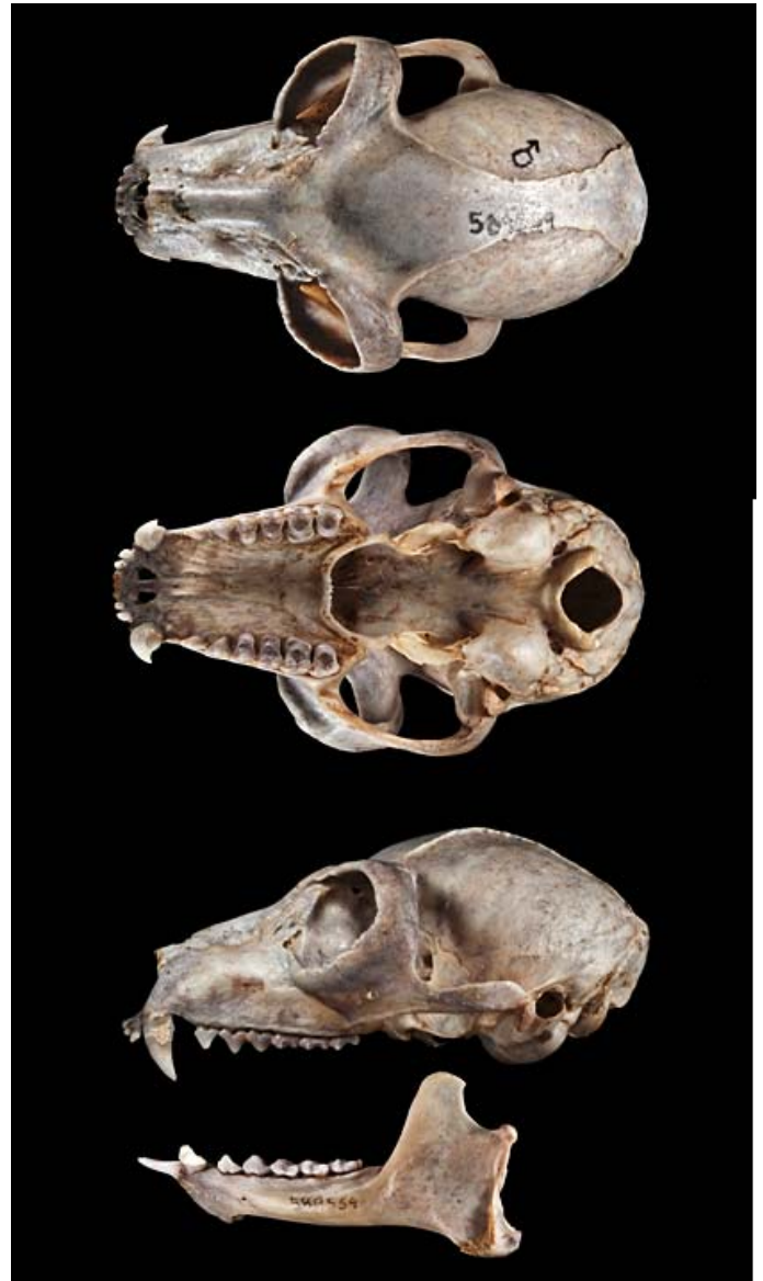
Fig. 2. —Dorsal, ventral, and lateral views of the skull and lateral view of the lower mandible of Lemur catta (adult male, United States National Museum no. 589559), collector and locality unknown.

The body of L. catta is covered with dense, gray to gray-brown pelage, slightly darker around head and neck, with the exception of the ventral side and face. The underside, throat, and face are lightly haired with a paler, off-white color that allows darker skin to show beneath. The eyes are accentuated by conspicuous black, triangular rings around them, contrasting sharply with the white interocular area (Garbutt 1999; Jolly 1966; Mittermeier et al. 2006; Tattersall 1982). The ears are large and well furred, but without tufts. There is no obvious body color difference between males and females but variation may exist between individuals in the facial region (Jolly 1966). Dorsally, they are warm rosy brown grading into pale gray or grayish brown on the rump,