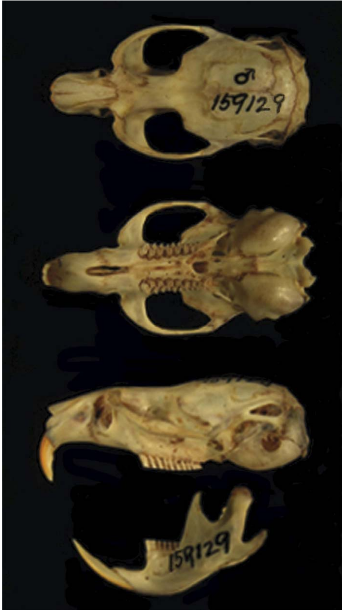
Fig. 2. —Dorsal, ventral, and lateral views of skull and lateral view of lower mandible of Microtus miurus miurus (adult male, United States National Museum 159129) that was collected on 23 April 1908 at Alaska: Mt. McKinley Range; Head of Toplat River. Greatest length of skull is 27.5 mm.

The color of the preadult pelage is similar to that of the adult. The winter pelage coloration is typically paler and grayer (Bee and Hall 1956; Rausch 1964) than the summer pelage. The winter fur is also longer than the summer fur (Banfield 1974).