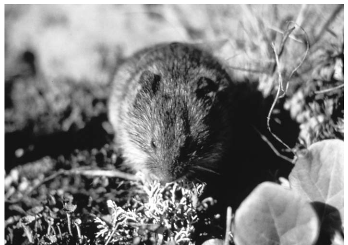
Fig. 1.—An adult Microtus miurus miurus from Alaska.