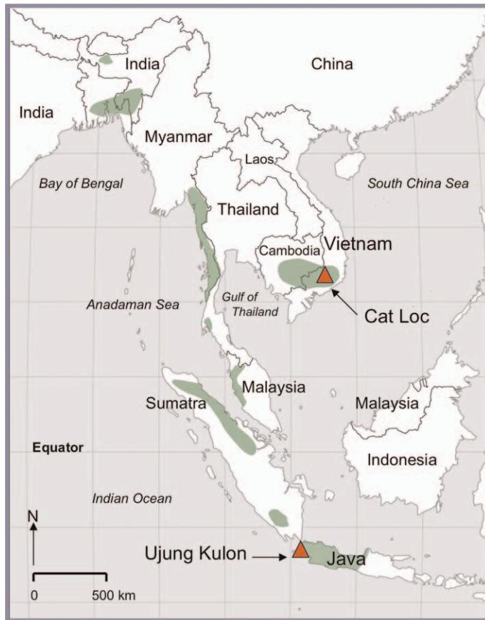
Fig. 3. — Rhinoceros sondaicus occurs in only 2 very small areas of southeastern Asia: Ujung Kulon, West Java (about 6°45'S, 105°15'E), and Cat Loc, Vietnam (about 11°35'N, 107°22'E; perhaps extinct). Green shading delimits areas of known historical distribution based on museum specimens collected beginning in the mid-1800s (Groves 1967; Rookmaaker 1980).

Java in Ujung Kulon National Park (Murphy 2004; World Conservation Monitoring Centre 2005) and Cat Loc in Cat Tien National Park in southern Vietnam (Santiapillai 1992; Schaller et al. 1990), if not now extinct in this latter locality. It once ranged throughout much of the central Indochinese subregion and the southwestern Sondaic subregion of southeastern Asia (Corbet and Hill 1992:map 106). Because of the critically endangered status of R. sondaicus , its general historical distribution and decline have been summarized repeatedly (e.g., Groves 1967; Harper 1945; Hoogerwerf 1970; Loch 1937; Rookmaaker 1980; Sody 1959). Lacking definitive records, we consider that generalized historical distribution of R. sondaicus (e.g., Foose and van Strien 1997; van Strien et al. 2008) to be overstated.