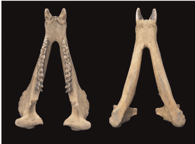
Fig. 5. —Dorsal (left) and ventral (right) views of the mandible of an adult Rhinoceros sondaicus (Natural History Museum [London] specimen 1876.3.30.1); note the large tusklike lateral incisors, characteristic of Asian rhinoceroses, and the 2 alveoli for the missing small central incisors (right mandible), characteristic of the genus Rhinoceros .

teeth of R. sondaicus “wear into ridges instead of a uniformly flat plane,” suggesting a browse diet (Lydekker 1907:35).