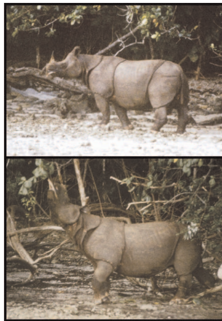
Fig. 1. —Rare images of an adult male Rhinoceros sondaicus from Ujung Kulon, West Java, in 1978; note the diagnostic dermal shields and prehensile upper lip used to grab forage in the bottom image.

Rhinoceros sivalensis Falconer and Cautley, 1847:pl. 73, figs. 2 and 3; pl. 74, figs. 5 and 6; pl. 75, figs. 5 and 6. Type locality “upper Siwaliks,” restricted to “Ratnapura series,” Ceylon by Deraniyagala (1938); fossil probably from the Upper Pleistocene.