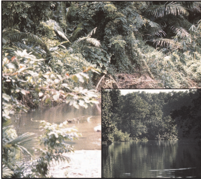
Fig. 7. —Typical stream and river (inset) habitats in Ujung National Park, West Java; Rhinoceros sondaicus often forages along the banks of such areas and uses them to wallow when those in the forest interior dry up.

Wallows also can be detected by well-worn paths, muddy vegetation, and trees that have been repeatedly rubbed with the head and horns of departing rhinoceroses. The reasons for wallowing include thermoregulation, skin conditioning, avoidance or removal of ectoparasites, and olfactory advertisement by impregnating the skin with the urine-rich water of the wallow (Ammann 1985; Hoogerwerf 1970; Schenkel and Schenkel-Hulliger 1969a; Sody 1959). When such wallows dry up during drought, R. sondaicus frequents edges of muddy river banks and tidal forests (Fig. 7; see video at http://www.arkive.org/javan-rhinoceros/rhinoceros-sondaicus/video-so08.html , accessed 15 September 2010).