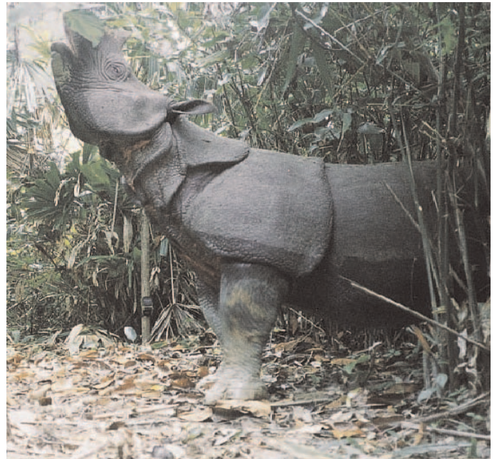
Fig. 6. —Male Rhinoceros sondaicus reaching for forage in a glade in Ujung Kulon National Park, West Java; reach of the prehensile upper lip is potentially increased by the mobility of the premaxillae in all but the most-aged adults; dermal neck folds and body shields are evident.

Tree species, particularly their saplings, and woody shrubs in second-growth forests dominate selected food items of R. sondaicus in West Java and include especially Spondias pinnata , Amomum , Leea sambucina , and Dillenia excelsa (Ammann 1985). Hoogerwerf (1970) mentions Glochidion zeylanicum , Desmodium umbellatum , Ficus septica , Pandanus , Lantana camara , and Vitex negundo —only 1 of which is in Ammann's list (at least at species level). Ammann (1985) noted that a large number of species of climbers were in the diet. R. sondaicus eats plants that have significant defenses against herbivory such as spines and thorns; Hoogerwerf (1970:105) noted that swamp thistle ( Acanthus ilicifolius ) and randu leuweung ( Gossampinus heptaphylla ) were eaten "without demur." While fruits such as those of kawung palm ( Arenga pinnata ), papaya ( Carica papaya ), and kemlandingan ( Leucaena leucocephala —Hoogerwerf 1970) have been found in feces, they do not seem to form an important part of the diet of R. sondaicus (Ammann 1985), in contrast to Indian rhinoceroses in Chitawan National Park, Nepal, which relish fruits of the ubiquitous