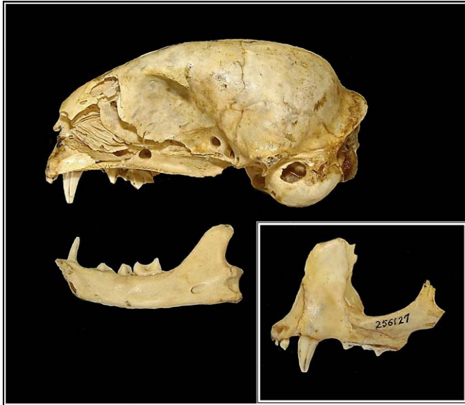
Fig. 3. —Lateral views of skull (top) and mandible (bottom) and broken piece of premaxillae–nasal and partial orbit (inset) of male Leopardus braccatus ; United States National Museum of Natural History, specimen 256127, labeled Oncifelis colocolo braccata , locality “Brazil: Mato Grosso, Descalvados, Upper Paraguay River,” collected by F. W. Miller, 29 November 1925 (see Miller 1930).

Lujanian (0.5 million–8.5 thousand years ago) localities in the Pampean region of Argentina (Prevosti 2006). A fossil of L. colocolo also was found in Tierra del Fuego, Chile, an island not currently inhabited by felids, and thought to be as young as the late Pleistocene or early Holocene (Prevosti 2006). L. colocolo split from the common ocelot ancestor about 1.7 million years ago, based on molecular estimates (Johnson et al. 1999). A fossilized left humerus identified as L. braccatus from the late Pleistocene–early Holocene recently was found in Serra da Bodoquena, Mato Grosso do Sul, Brazil, near the type locality (Perini et al. 2009).