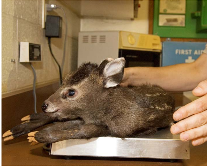
Fig. 4. —Weighing a neonatal Elaphodus cephalophus at Front Royal (Virginia), Smithsonian Conservation Biology Institute, National Zoological Park; note light tan-brown hooves of the neonate that blacken with age and characteristic midline spots that fade with age.

divided by the diameter of the hair shaft) of guard hairs from E. cephalophus was comparable to that of other Chinese cervids that inhabit cold climates (Sheng et al. 1993).