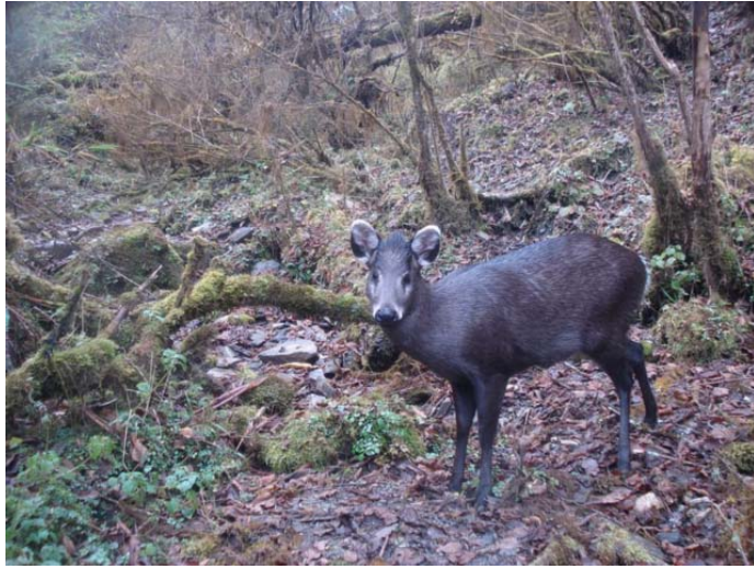
Fig. 5. —Typical forested habitats of Elaphodus cephalophus in southern China tend to have open understories but often with abundant shrubs (not obvious here) and herbaceous vegetation for cover and food. Photograph taken during the camera-trap surveys of Li et al. (2012) in Sichuan, Gansu, and Shaanxi provinces, China, and freely available at Smithsonian Wild ( www.siwild.si.edu ).

Shaanxi (Zeng et al. 2007), and Tangjiahe Reserve, Sichuan, where they were found significantly disjunct from human settlements (Wang et al. 2006).