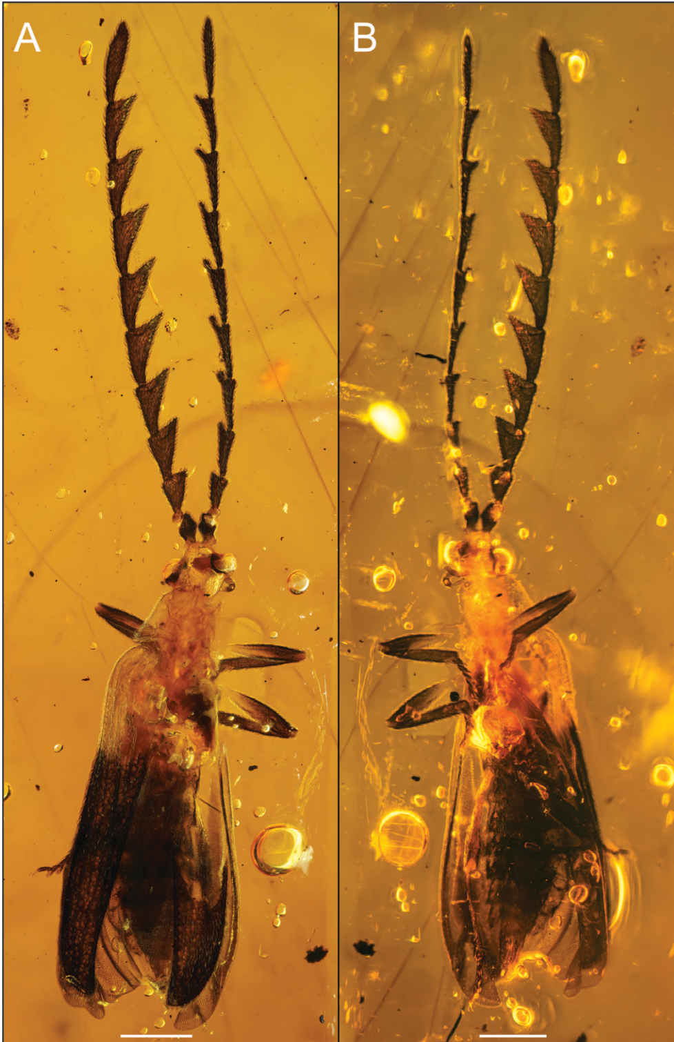
Fig. 1. Falsoceratoprion fumagalliae , new genus and new species. A) Dorsal view, B) Ventral view. Scale bar = 0.5 mm.