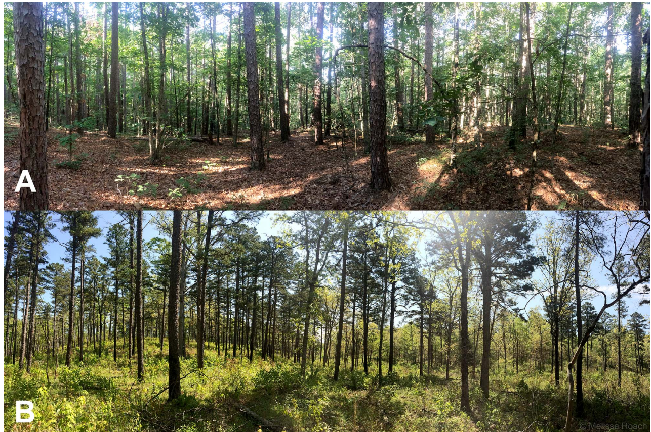
FIGURE 1. Examples of (A) untreated, closed-canopy forest and (B) pine–oak woodland in the process of restoration after tree thinning and prescribed fire in the Ozark Highlands, Missouri, USA.

139,903 ha in the Mark Twain National Forest (MTNF) in Missouri (Mark Twain National Forest 2011). While management is occurring throughout the CFLRP area, treatments are scattered and varied in intensity. We selected 4 70-ha plots within the CFLRP that were accessible by road, known to have moderate detections of our focal species based on point count surveys completed the year prior to our study, and not scheduled for treatment during the study period. Selected plots had received restoration treatment(s), but the extent of management and local site features varied, resulting in a heterogeneous vegetation gradient that spanned a continuum from open savanna–woodland to mature, closed-canopy forest.