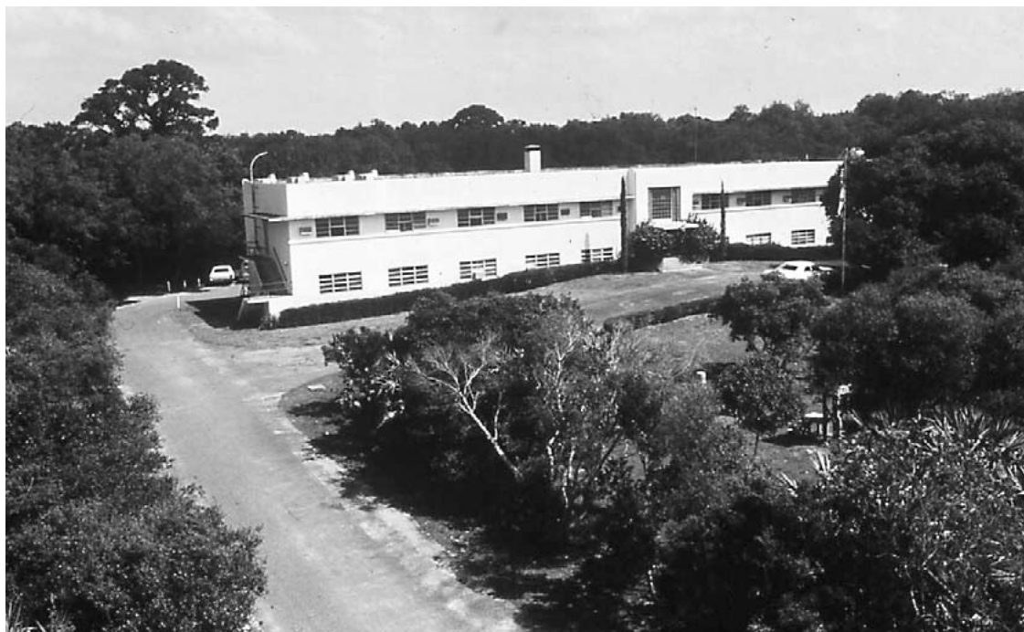
Fig. 3. The Florida Medical Entomology Laboratory at Vero Beach, Florida, as dedicated in 1957.