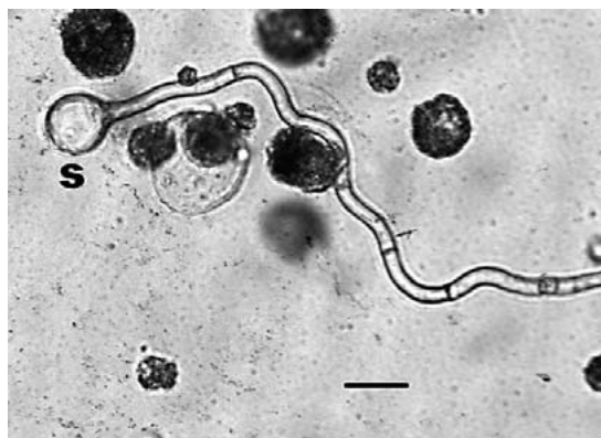
Fig. 2. Entomophaga grylli pathotype 1 walled, septate, empty hypha originating from now empty spherical cell. Bar = 35 microns.

The species of the Entomophaga grylli complex that are fastidious grasshopper and locust pathogens have not been reported to complete their life