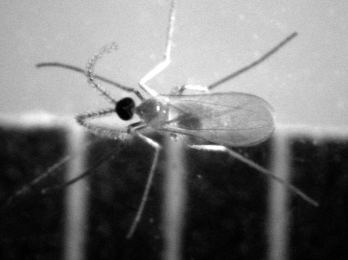
Fig. 2. Adult Feltiella n. sp., a predator of the citrus rust mite Phyllocoptruta oleivora reared in the laboratory. The vertical bars beneath the insect are in millimeters.

were usually eaten when grasped on any part of their bodies.