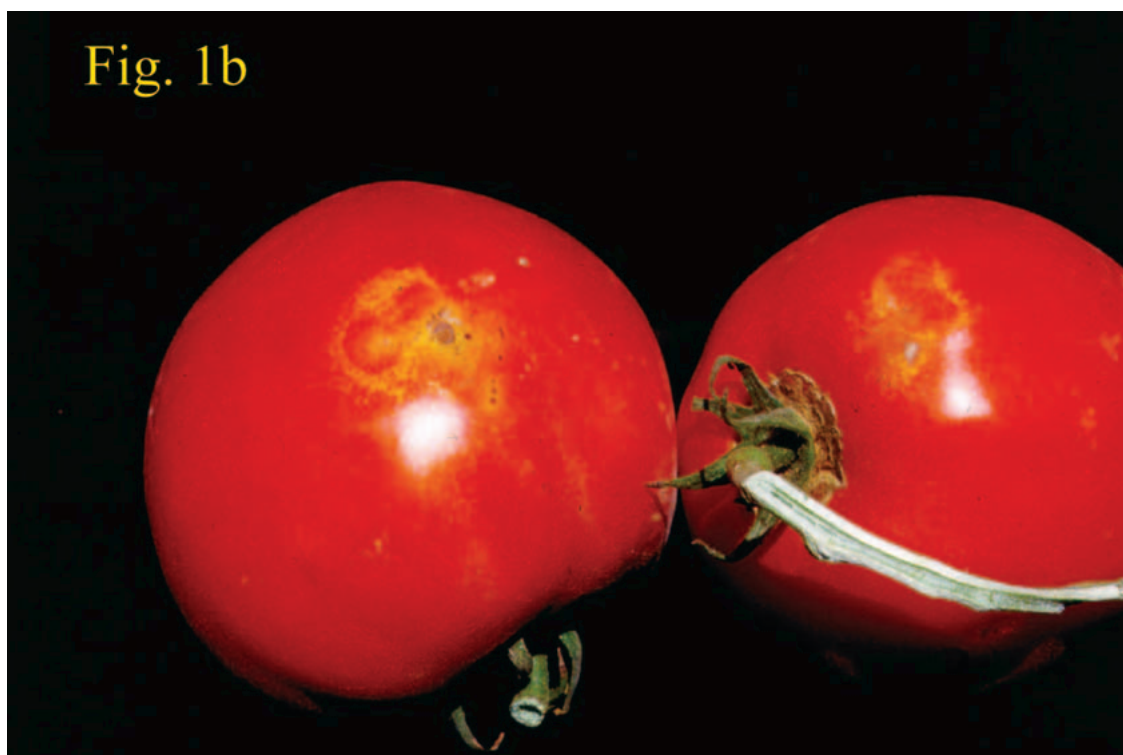
Fig. 1. (a) Goldflecks on tomato caused by feeding of F. occidentalis (Pergande). (b) Goldfleck rings on tomatoes at the spot they were touching each other, caused by feeding of F. occidentalis (Pergande).