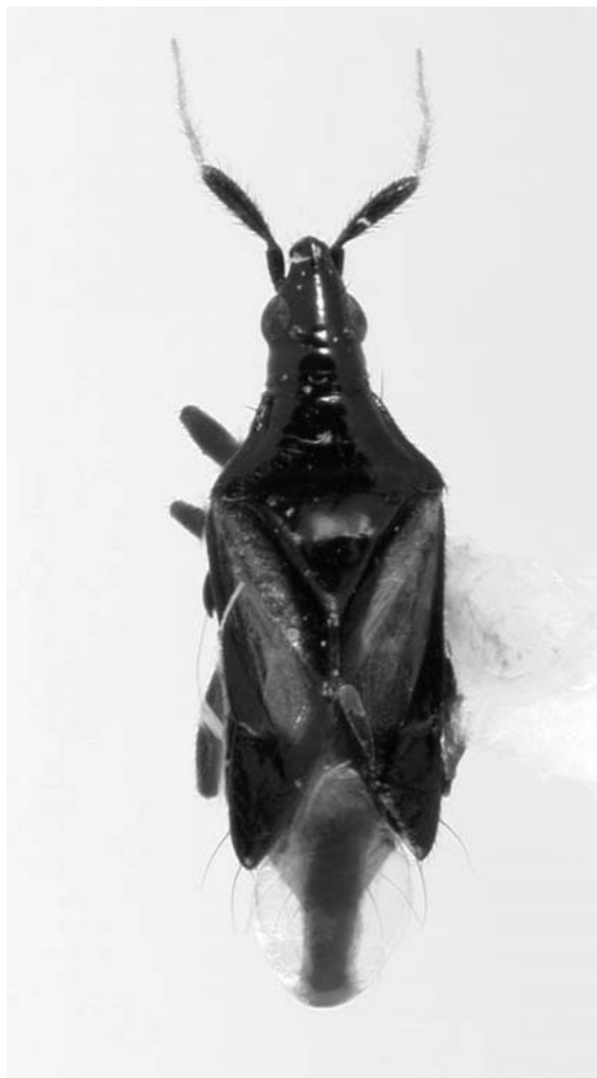
Fig. 1. Montandoniola moraguesi , dorsal view.