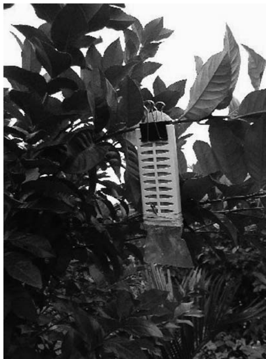
Fig. 2. Dichlorvos dispenser modification with blue stripe and sample collecting bag placed in the top canopy of a lemon tree in Neipu, Pingtung County, Taiwan.

Experiment 1. Taiwan (dry season). The experiment was conducted in a 0.6-ha lemon ( Citrus limon L., cv. Eureka) orchard for eight weeks from 26 November 2004 to 30 January 2005 in Neipu,