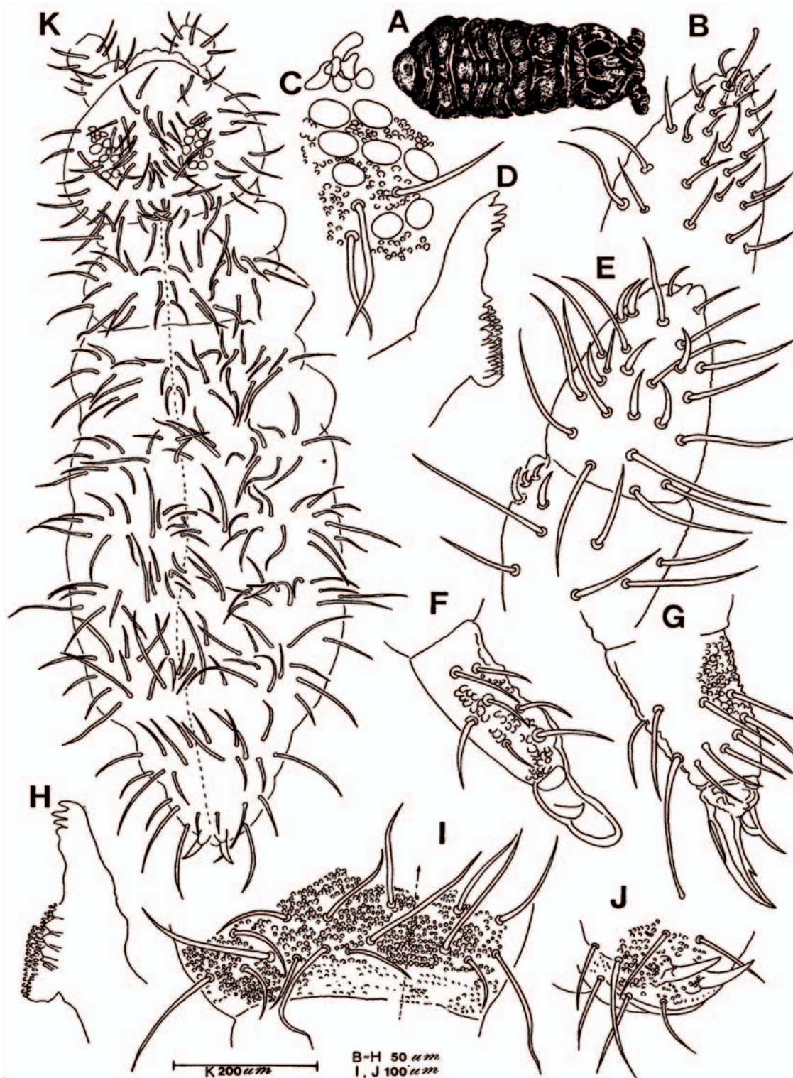
Fig. 2. Ceratophysella platyna n. sp. A. Habitus. B. Ventral view of antenna IV segment. C. Postantennal organ (PAO) and 8 ocelli. D. Left mandible. E. Dorsal view of antenna IV segment. F. Dorsal view of mucro and dens. G. First leg. H. Right mandible. I. Abdomen V segment. J. Anal spine. K. Dorsal chaetotaxy of body.