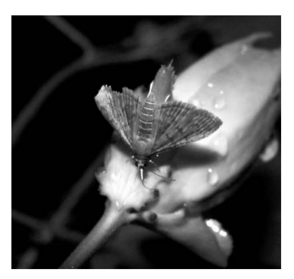
Fig. 1. Tropical sod webworm moth, Herpetogramma phaeopteralis Guenée, feeding on extrafloral nectary of Passiflora incarnata L.