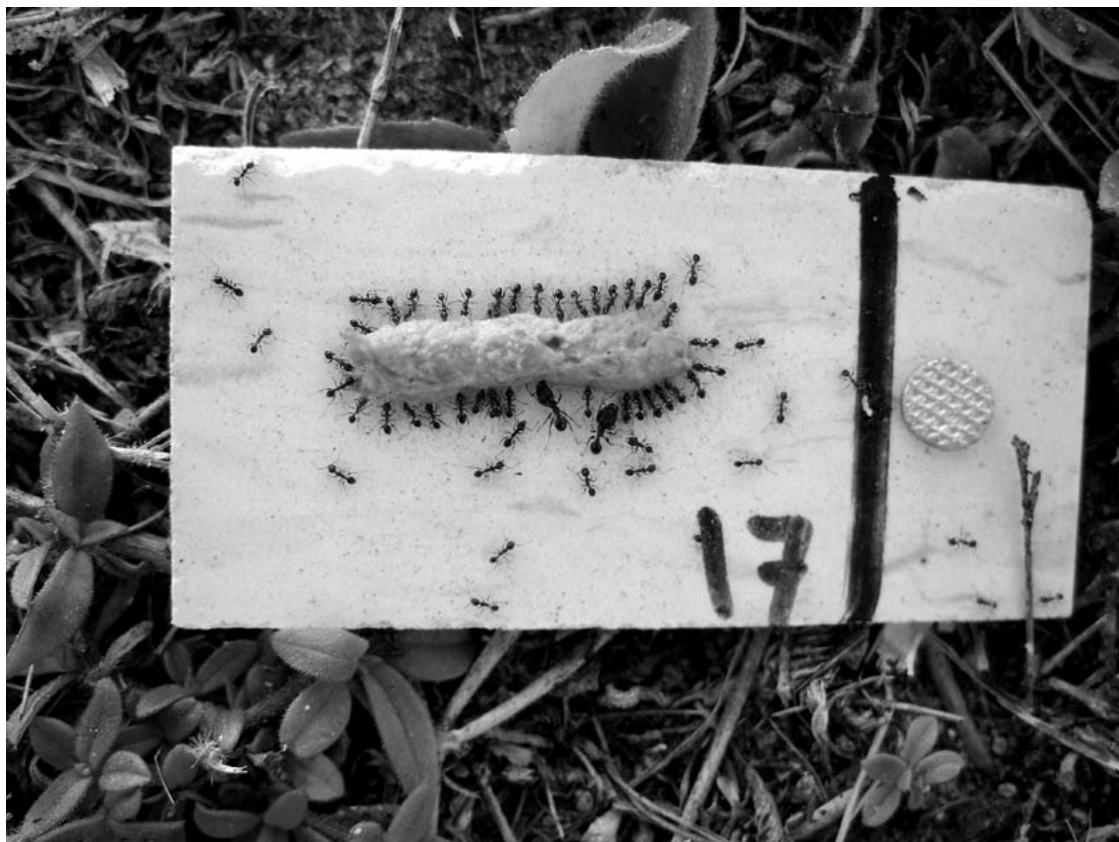
Fig. 2. Count station (approx. 3.5 \times 7 cm). Bigheaded ants are feeding on oil/protein bait. Ants on the tile to the left of the black line were counted. A nail to the right of the line holds the tile in place on the soil surface.

tained lower numbers than the other treatments. These relationships continued to 28 DAE after which data were no longer collected.