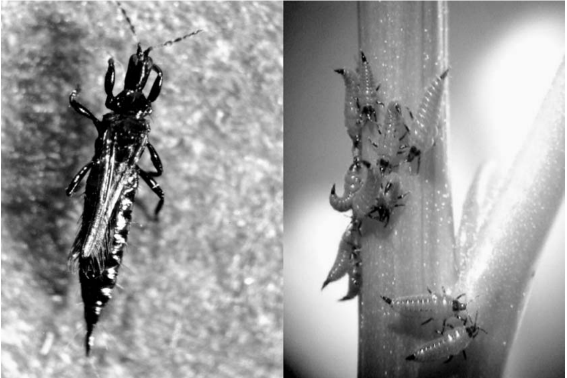
Fig. 1. Adult female (left) and cluster of larvae of P. ichini on stem of Brazilian peppertree, Schinus terebinthifolius.

thrips from escaping. Each cage was labeled with a colony number, the host plant species, and the date. Approximately 20 to 25 d after the parental adults were placed on the plant, a new generation of thrips larvae was produced. Developing larvae were collected by cutting a shoot tip with scissors and carefully transferring the thrips-infested shoot into a 50-dram clear plastic snap cap vial with holes punched in the lid with a teasing needle for ventilation; the holes were sealed with a piece of Kimwipe® sandwiched between the lid and the vial. A freshly cut young shoot of the same host plant species (~8.5 to 9 cm long) was placed inside the vial as a food source. Before using the new shoot tip, we sprayed it with a 10% bleach solution in order to kill bacteria and fungi, and then thoroughly rinsed it with tap water. A piece of standard filter paper (9 cm diam.) moistened with a few drops of tap water was placed in the vial to maintain humidity. A maximum of 80 larvae was placed inside each vial. The snap cap vials were transferred to larger, round, clear plastic containers (26 cm diam × 9 cm ht) and placed inside a growth chamber set at 23.0°C and a 16:8 (L:D) photoperiod.