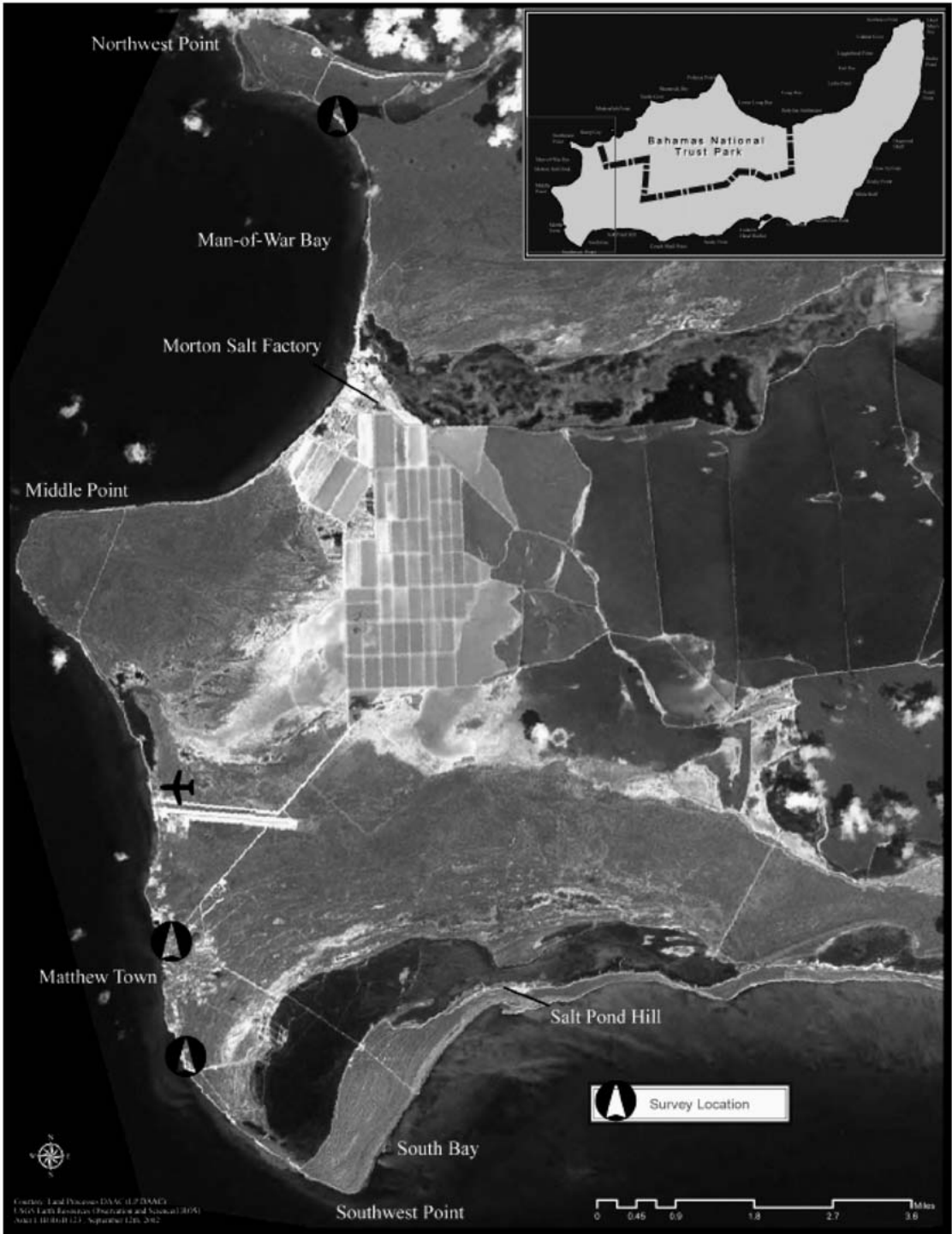
Fig. 2. Satellite photograph of the west end of Great Inagua showing survey sites for O. hyalinipennis .

easily accessible sites with dense populations of cotton were chosen for study. The majority of Great Inagua is made up of large saltwater ponds