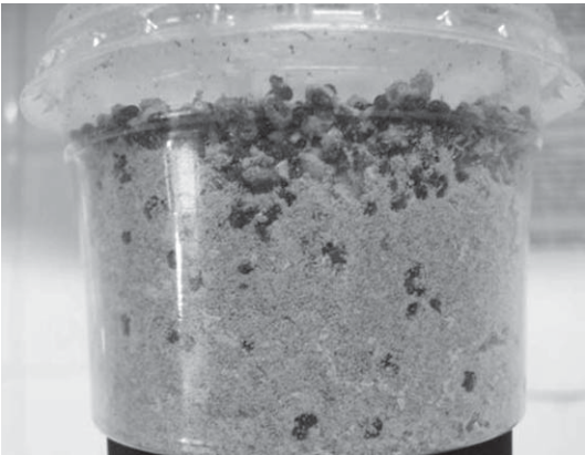
Fig. 2. Container with dehydrated pollen with a heavy infestation by the cigarette beetle, Lasioderma serricorne (Coleoptera: Anobiidae).

Insect contamination was observed in dehydrated bee pollen from Neópolis, Pacatuba, Brejo Grande and Estância municipalities which had a water content > 8% (Table 1).