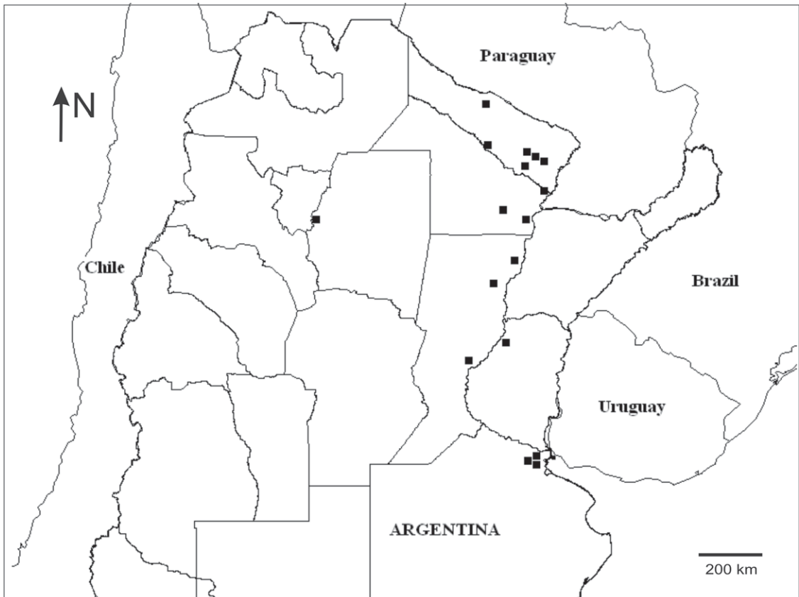
Fig. 11. Map of Argentina with collection sites for Lepidelphax pistiae gen. et sp. nov. (black squares).

Male: Small to medium-sized, predominantly brachypterous forms.