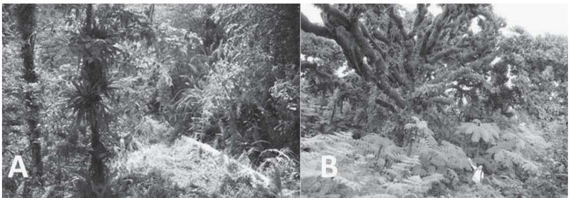
Fig. 1. Collecting sites on Isla del Coco, A) trail to Rio Genio, B) trail to Cerro Iglesias.

The DNA barcodes of the ants from Isla de Coco were compared with those of a larger ongoing inventory of the ants in Area de Conservación Guanacaste (ACG), northwestern Costa Rica