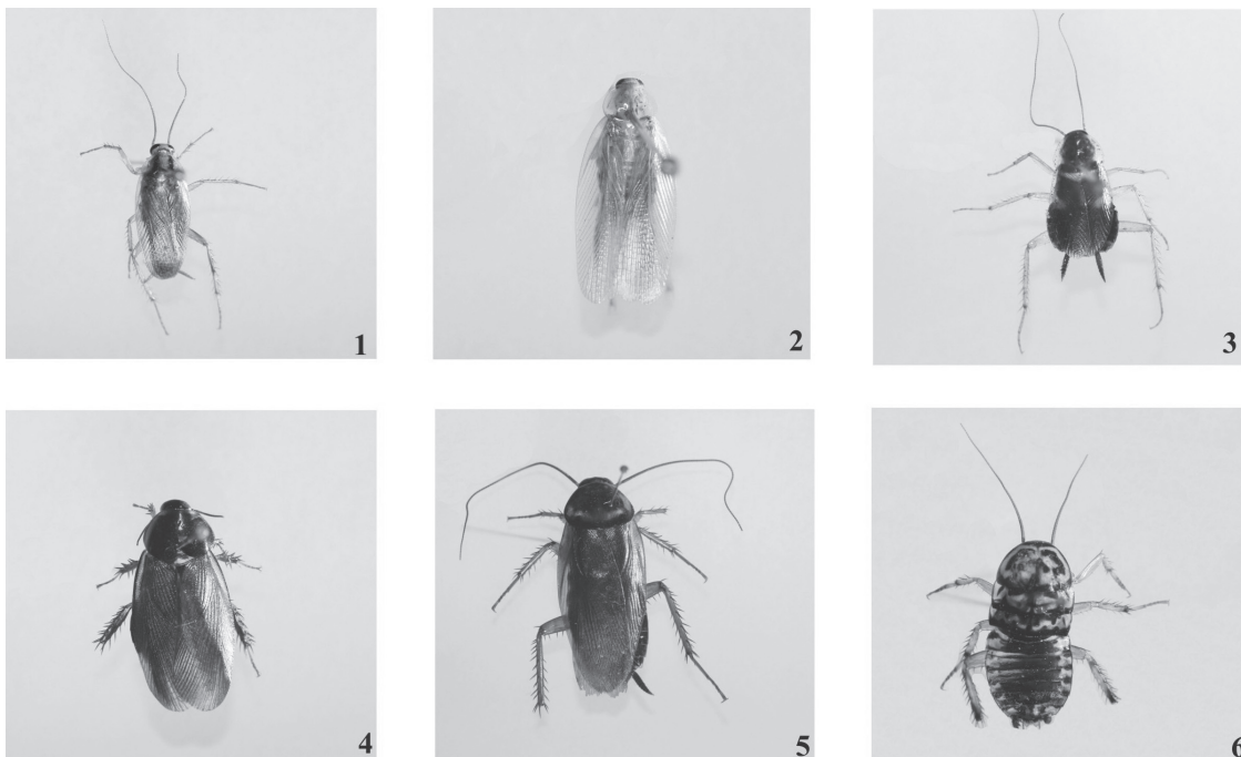
Plate 2. Habitus (dorsal view) of each of 6 Blattodea species in Kolhapur District, Maharashtra State: 1. Blatella germanica , 2. Blatella humbertiana , 3. Supella (supella) longipalpa , 4. Pycnoscelus surinamensis , 5. Periplaneta americana , and 6. Neostylopyga rhombifolia