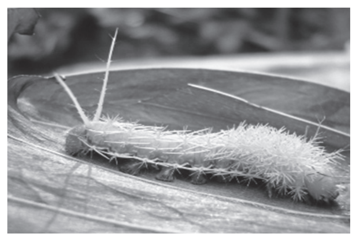
Fig. 2. Caterpillar of Periphoba hircia (Lepidoptera: Saturniidae).

an area of 500 ha in the Peruvian Amazon where it was considered a pest (Couturier & Kahn 1993). It was a secondary pest of Eucalyptus urophylla S. T. Blake (Myrtales: Myrtaceae) in San Carlos, Colombia with outbreaks in isolated areas during the rainy season (Rosales 2001).