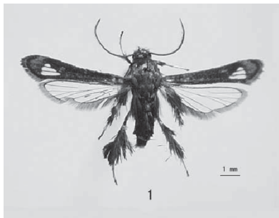
Fig. 1. Oligophlebia minor Xu & Arita sp. nov. , male, holotype.