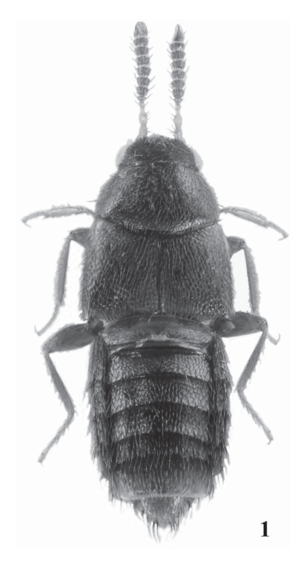
Fig. 1. Habitus of Agaricomorpha\ ashei\ {\bf sp.\ nov.}\ 1.6 mm.

3) with distinct median tooth, prostheca well developed, divided into two distinct areas, condylar molar patch narrow, composed of toothlike structures; maxillary palpomeres (Fig. 4) 2–3 dilated distally, 4 with a small spine at apex; labium (Fig. 5) with ligula protruded, parallel-sided, divided in apical three-fourths, almost as long as labial palpomere 1, labial palpus with two palpomeres,