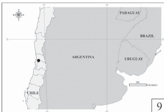
Figs. 8-9. Host fungus and distribution of Cis bilamellatus Wood, 1884 in Chile. 8. A basidiome of Ganoderma australe , used as host. 9. The single distribution record (full circle) in the country.

latus were found inside basidiomes of Ganoderma australe (Fig. 8) developing on live tree trunks of water oak ( Quercus nigra L.), an introduced tree, which formed a grove located on the edge of a country road.