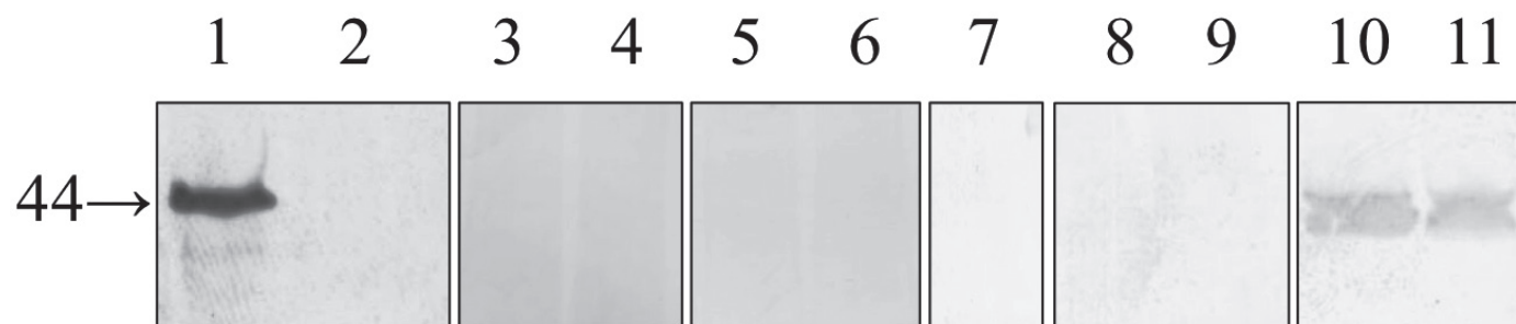
Fig. 1. Representative western blot analyses to detect the presence of SINV-3 capsid protein (VP2) in different ant species. Lane assignments are as follows: 1) purified SINV-3; 2) S. invicta negative control colony; 3,4) S. aurea ; 5,6) S. xyloni ; 7) S. carolinensis ; 8,9) S. molesta ; 10,11) S. invicta positive control colonies. Molecular retention indicated as kDa.

nopsis , did not support replication of SINV-3. Western blot analysis produced distinct bands for the viral capsid protein (VP2, see Fig. 1) in all 4 of the treated S. invicta colonies (Table 1) indicating that the virus was replicating. Furthermore, all 4 treated S. invicta colonies had stopped growing by the end of the test (Table 1) and contained either no brood (3 colonies) or only a trace of brood (1 colony). In contrast, the capsid protein (see Fig. 1) was not detected in the 3 treated S. aurea colonies or the 2 species of thief ants (Table 1) confirming the lack of viral replication in these ants. The capsid protein was also not found in 3 of the 4 untreated S. invicta colonies (see Fig. 1; the 4th colony was not tested because of space limits, Table 1). After 7 wk, 3 of the 4 S. invicta control colonies and all of the S. aurea colonies contained large amounts of brood and had at least doubled in weight (Table 1). Brood production had stopped in 1 of the untreated S. invicta colonies and 1 of the S. molesta colonies (Table 1), but neither colony contained capsid protein evidence of replicating virus. The S. carolinensis colony and the other S. molesta colony remained healthy with large amounts of brood. Four months later, all of the S. aurea colonies, the S. carolinensis colony, and the one S. molesta colony remained healthy.