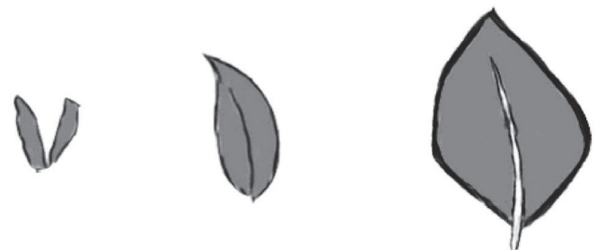
Fig. 1. Sketches of citrus leaves at several maturity stages.

For the purposes of this study 4 key EPG variables were measured and analyzed (i.e., duration of pathway phase, C; duration of xylem