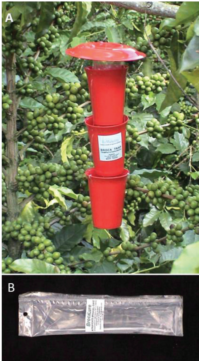
Fig. 1. A red funnel trap used to capture CBB ( Hypothenemus hampei ) (A) and the methanol-ethanol lure (3: 1 ratio) enclosed in a semi-permeable membrane (B). CBB were collected in a plastic container containing 200 mL of soapy water.

populations declined through the smaller harvest (Mar–Jun). Fewer CBB were collected in the small coffee farms (Viterbo) (averages of 38 to 105 CBB per trap/week), however, a similar seasonal trend was observed, with captures peaking from Jan–Mar (Fig. 2B). The start of the peak flight activity on smaller farms (Jan) again correlated with higher berry infestation (> 2.5%), and dropped later in the year as flight activity declined. A positive linear correlation (Pearson coefficient) between number of CBB captured and percent berry infestation was observed for both large ( r^2 = 0.90 ) and small ( r^2 = 0.68 ) farms. A similar relationship was reported by Pereira et al. (2012) in Brazil. However, their regression model could not determine an action threshold for CBB, since the intercept indicated that no CBB were caught at a low field infestation ( \approx 3 to 5% berry infestation), which was not observed in our study.